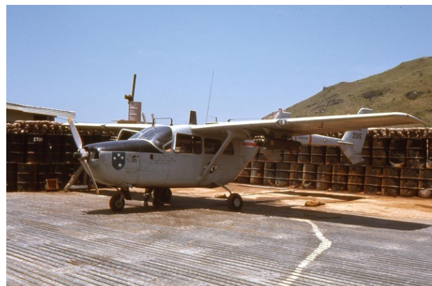
The O2A at Duc Pho in May 1968.