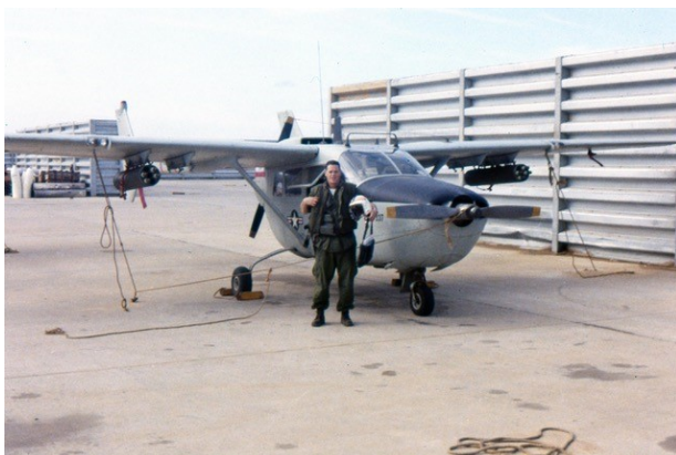
The O2A at Chu Lai in October 1967.

We also maintained aircraft on ground "five-minute" alert to intercept and identify unknown aircraft in the system. We did these intercepts frequently due in part to the large volume of aircraft flying in the Vietnam airspace and the critical nature of the environment.