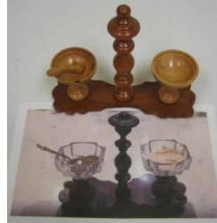
Carl Cummins - New-Cherry & Mahogany