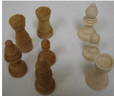
Carl Cummins - Old-Dowels; New-Privet