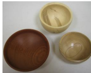
Carl Cummins - Old-Poplar; New-Holly & Mahogany