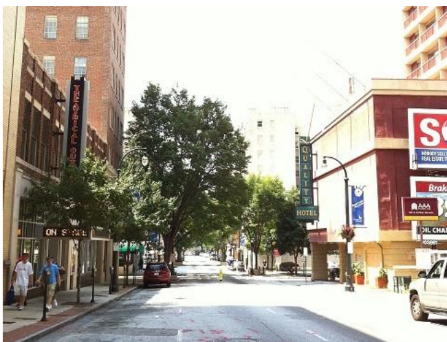
Photo 2: Luckie Street in 2011, featuring Balzer Theater at Herren's

After closing their doors, the building remained vacant for nearly 17 years until 2004 when Theatrical Outfit discovered the location. Previously located at various facilities around Atlanta, Theatrical Outfit was looking for a permanent place to call home. After considering several other locations, the group settled on Herren's due to its cultural legacy and historical significance.