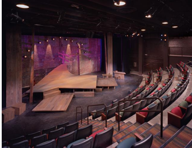
Photo 3: Theater Performance Space

The north-facing storefront is a mix of historical and modern windows. The first floor windows utilize high-performance glazing and provide daylight for the entire first floor lobby that is connected to the main floor of the theater. The second floor windows were renovated with modern operable windows that are larger than the previous one. The windows increase daylight to the second floor administration offices while providing natural ventilation during seasonally appropriate times of the year.