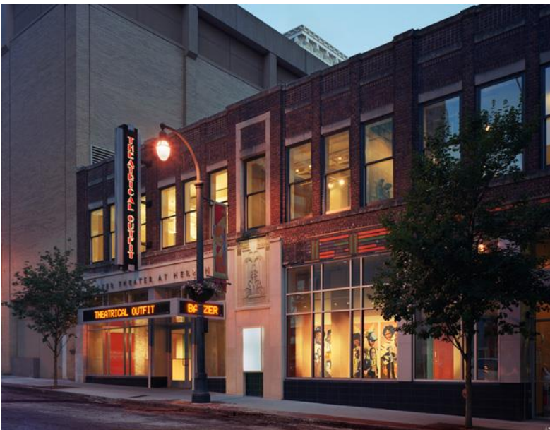
Photo 4: Front Exterior of the Theater

The north-facing storefront is a mix of historical and modern windows. The first floor windows utilize high-performance glazing and provide daylight for the entire first floor lobby that is connected to the main floor of the theater. The second floor windows were renovated with modern operable windows that are larger than the previous one. The windows increase daylight to the second floor administration offices while providing natural ventilation during seasonally appropriate times of the year.