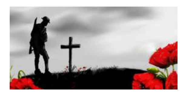
Lest we forget...

Schools will usually hold special assemblies for the first half of the day, or on the school day prior, with various presentations concerning the remembrance of the war dead.