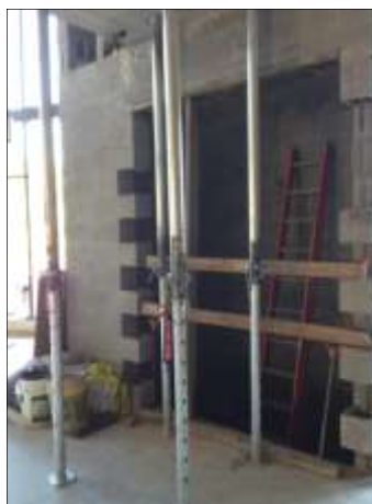
Going up! Elevator progress.