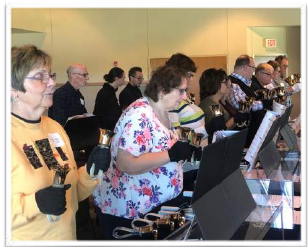
Oh my! It's a ringing Robin!