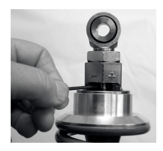
FIG 1 FIG 2

2. Turn the tool towards the minus sign on the end of the damper unit until it stops. The rebound damping is now on minimum. As you adjust the rebound damping count the number of sweeps. A sweep is the movement from one side to the other, which is also a quarter of a revolution. See FIG 1 and FIG 2.