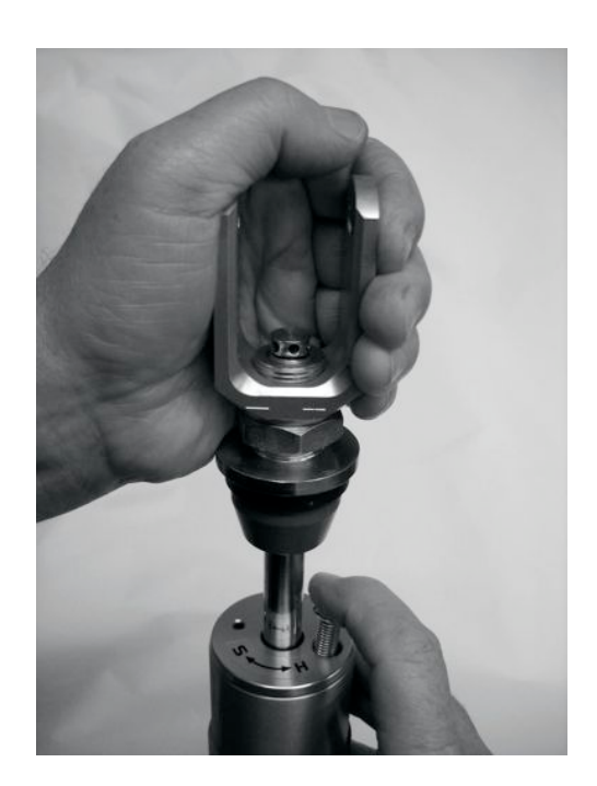
FIG 3 FIG 4

3. Turn the whole piston rod assembly clockwise (as you look over the shock) towards the 'S' meaning Soft. As you turn the rod assembly it clicks, count the number of clicks until the rod assembly stops. The high speed compression damping is now on minimum. See FIG 4