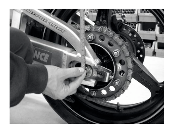
FIG 9 FIG 10

If you have reduced the overall weight of the bike considerably you may have no sag to begin with.