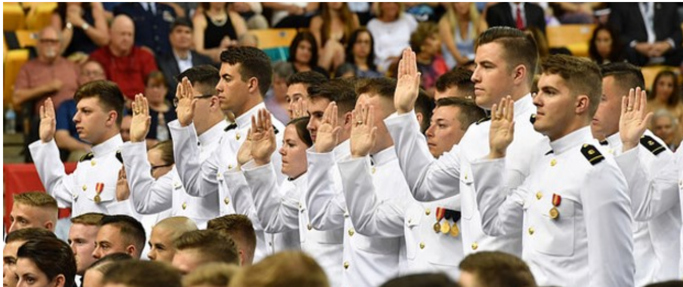
VMI Commissioning 2018