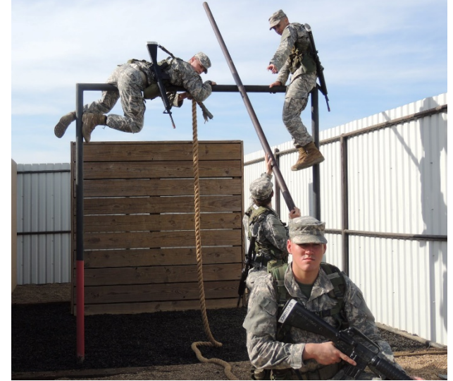
Texas A&M – Leadership Reaction Course – Apr 2019