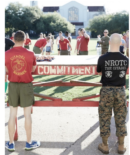
Citadel – Bulldog Challenge 2019