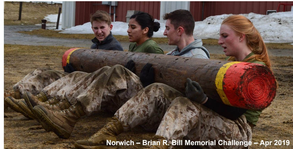
Norwich – Brian R. Bill Memorial Challenge – Apr 2019