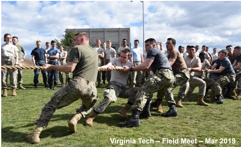
Virginia Tech – Field Meet – Mar 2019