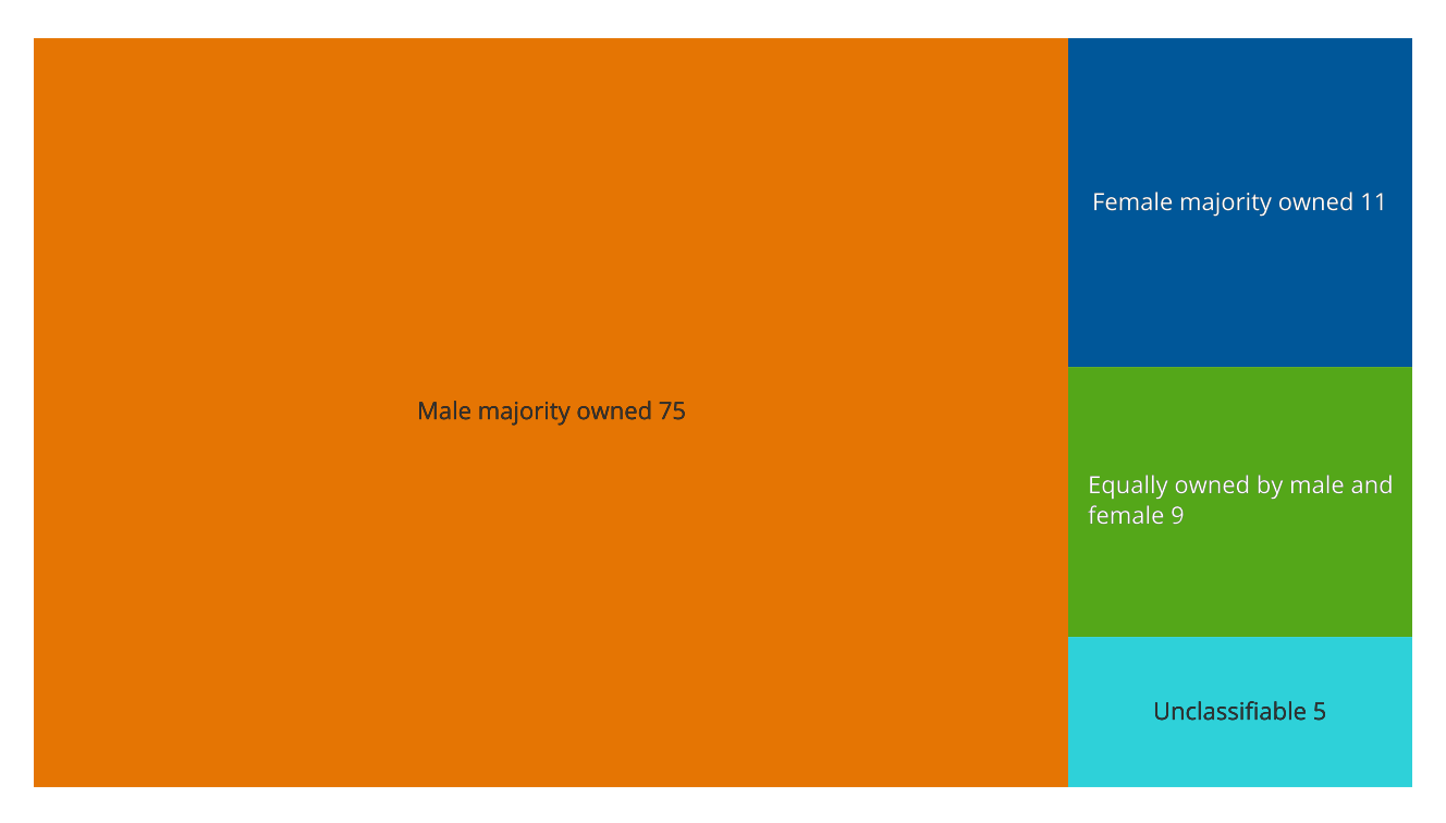
Figure 1 Distribution of companies with 1–9 employees that perform domestic R&D, by sex of primary owners: 2018