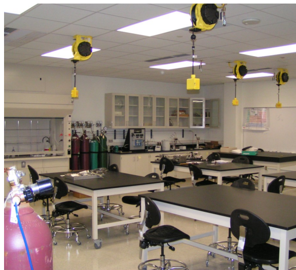
Seeley Mudd 223 (on left) Mudd 227 (above)