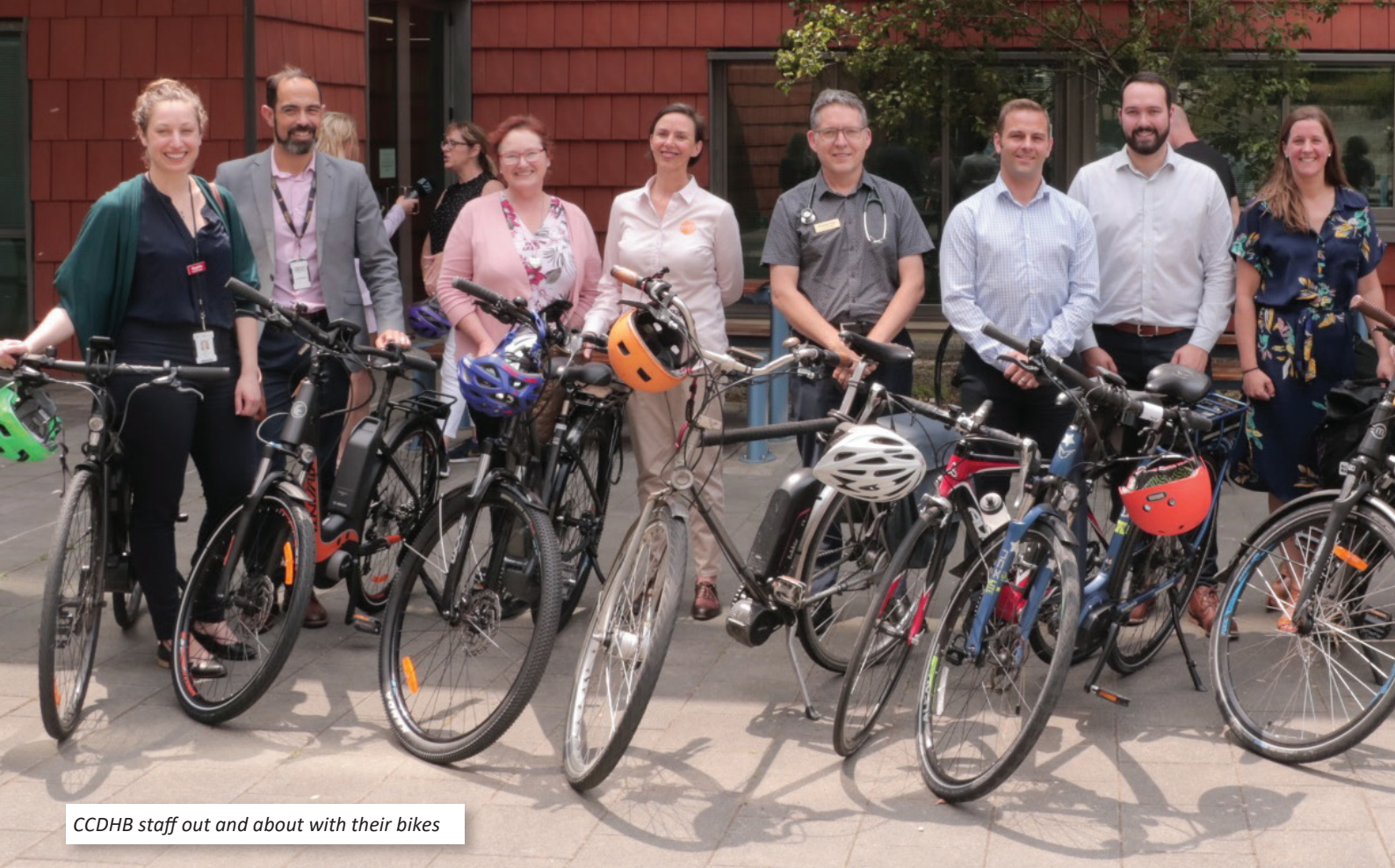
CCDHB staff out and about with their bikes