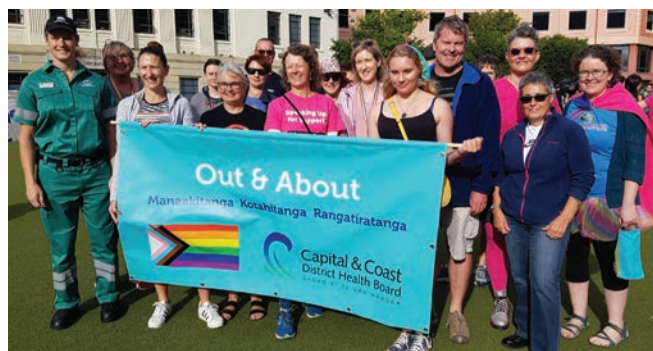
Our group at the Wellington Pride Whānau Hikoi

CCDHB has participated in Pink Shirt Day for the past few years. Pink Shirt Day takes place on 22 May and is an opportunity to turn the workplace māwhero/pink