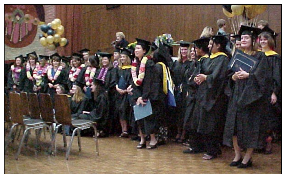
Hip Hip Hooray! The graduates receive a standing ovation.