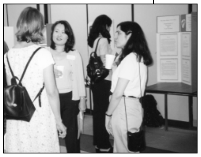
Students discuss persentations at last year's Peninsula Dietetic Association SJSU Student Poster Session.