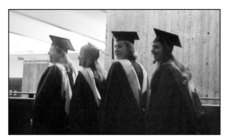
Ready, Set, Let's Go!