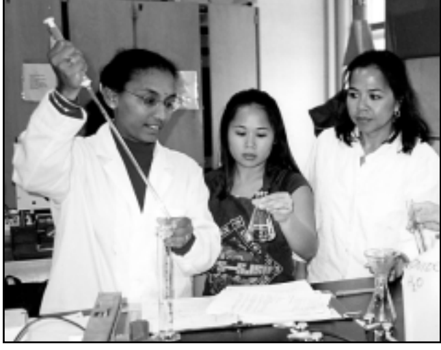
Students perform lab experiments to understand the principles of food technology.

June 23-27 Annual Meeting, Institute of Food Technologists, Chicago, IL