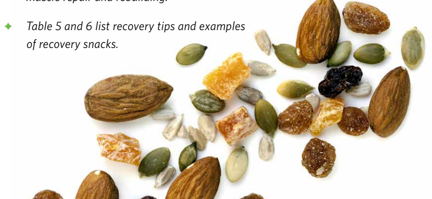
Table 5: POST-EXERCISE RECOVERY TIPS

Add a small amount (~20 grams) of protein to the first feeding to stimulate muscle repair and rebuilding.