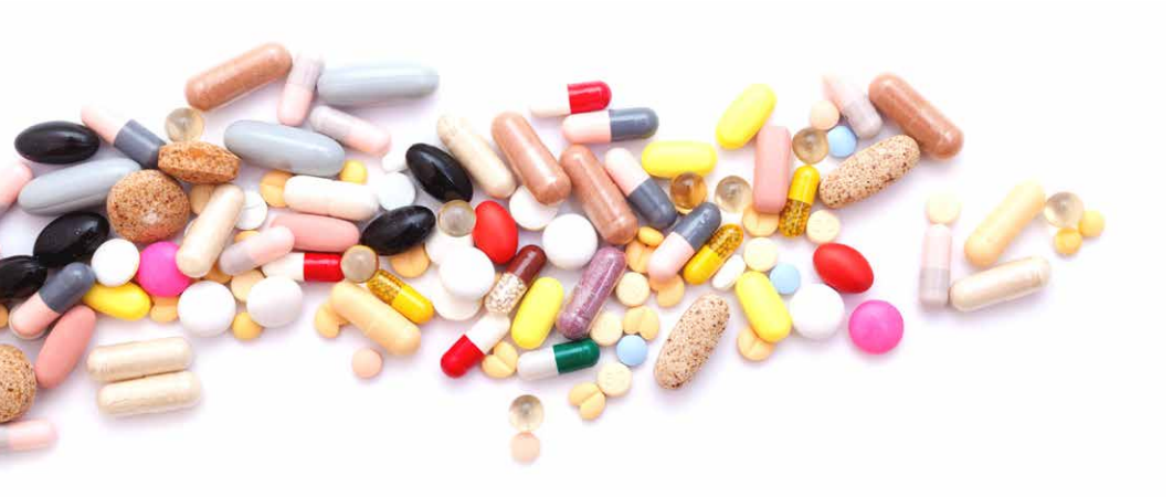
Table 11: MICRONUTRIENT SOURCES

Athletes should always choose food over dietary supplementation. The body needs more than 40 nutrients every day and supplements do not contain all the nutrients that are found in food. Supplements cannot make up for a poor diet or poor beverage choices.