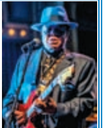
SEE BANDSTAND FOR MORE