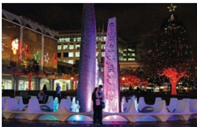
Centennial Square in downtown Victoria