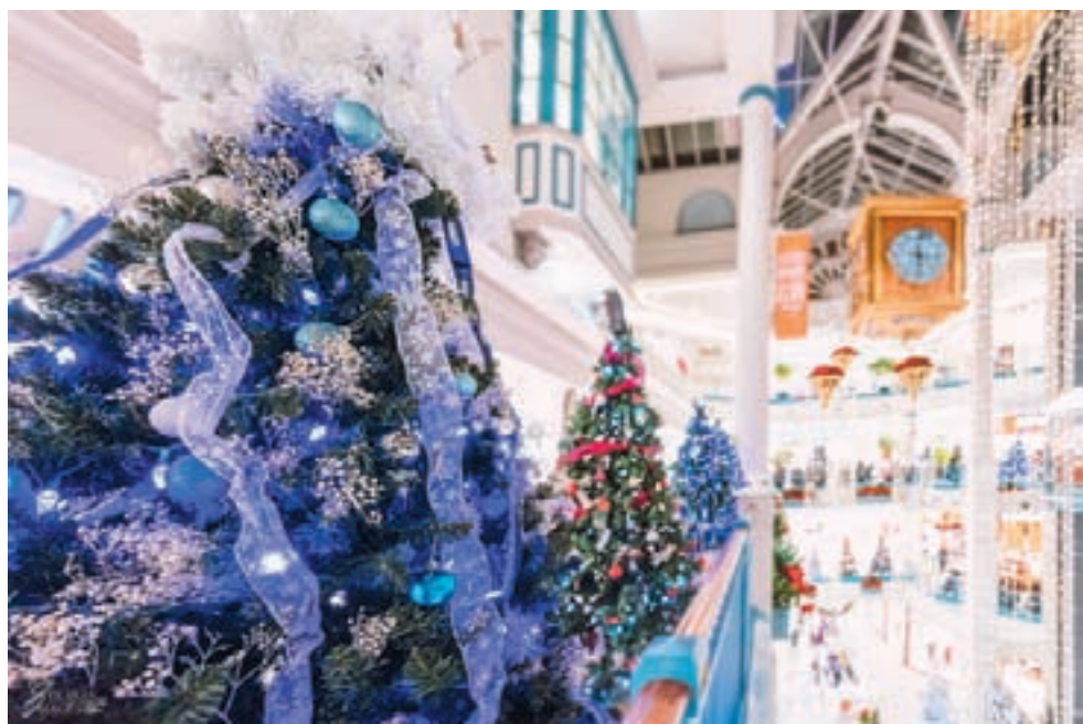
Bay Centre Festival of Trees