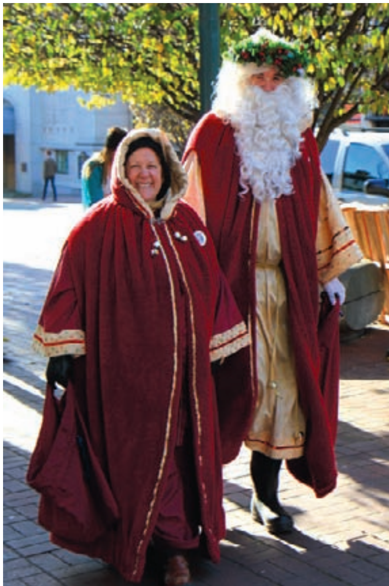
Father Christmas on Government St. in Victoria

For a comprehensive list of holiday events, sites and exciting activities and promotions, check out Victoria's fantastic Advent Calendar, www.tourismvictoria.com/christmas .