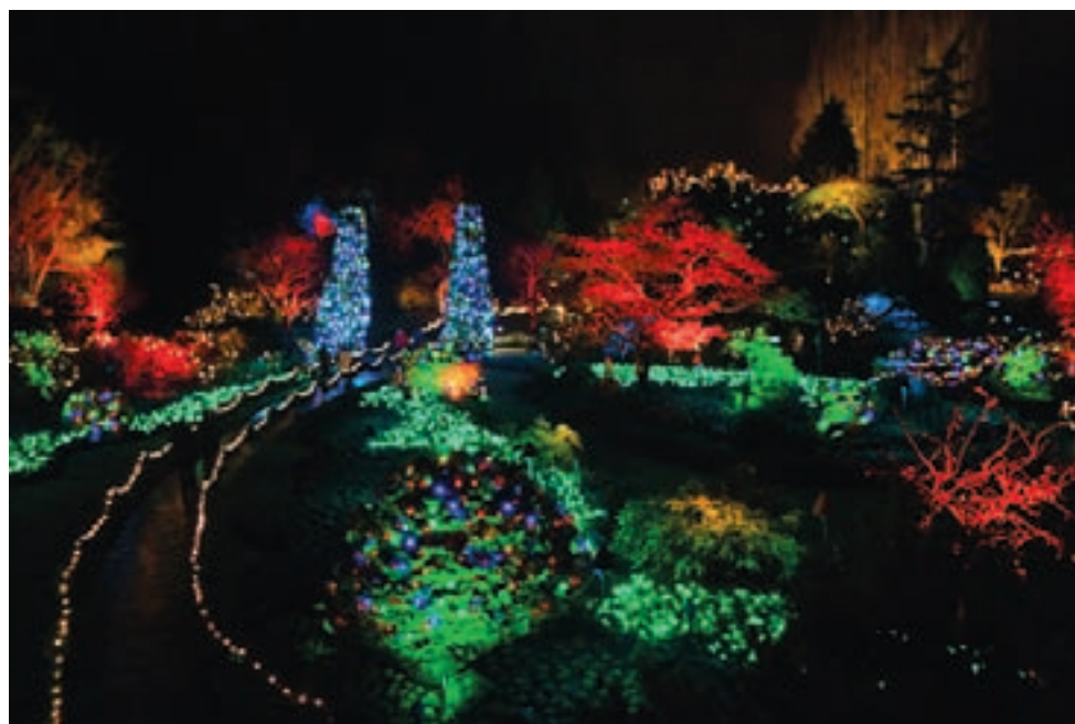
Christmas at Butchart Gardens