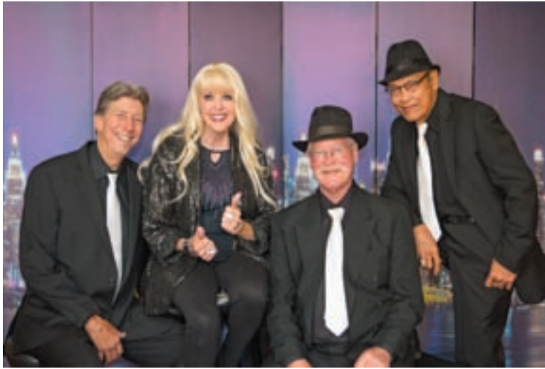
Taska & The Party Band

ALL ABOARD THE SS EAGLES on 12-31-16! SHIPS AHOY! The Gresham Eagles is located at 117 N.E. Powell, Gresham, Ore. Phone: 503-667-3019.