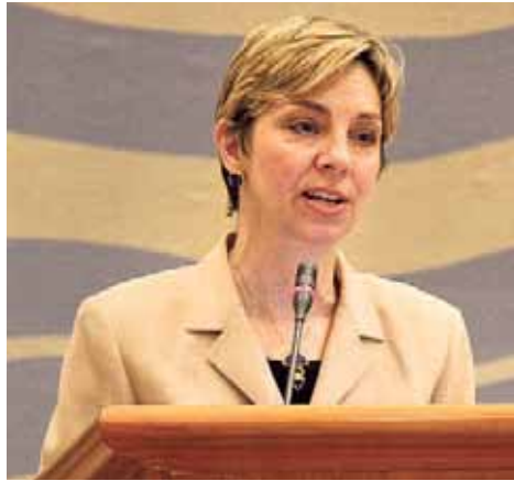
GLOBAL DEVELOPMENT NETWORK

"If we put actual money in, we want to have a good result for that money — as it is an investment," he said.