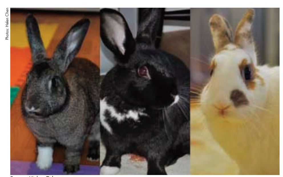
Penny, Kirby, Toby

I placed HEPA air filters in every room of my two-bedroom apartment and operated most of them 24/7 on a low-power setting. The apartment was vacuumed from top to bottom at least once a week with a HEPA-filter vacuum, and high-traffic bunny areas were hand-vacuumed to remove fur balls and bits of hay. The