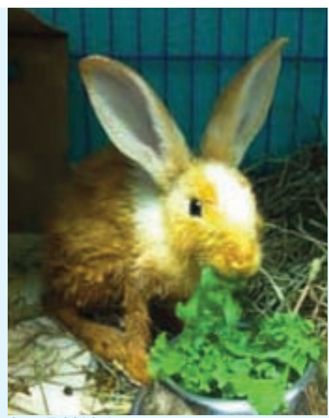
Sept. 7, 2010. Benita eating greens, ears up

After Kitty and Cindy leave, I reheat both SnuggleSafes and put them back in cage (it's 8 p.m. and maybe they will stay warm through the night, though manufacturer guarantees only eight hours of heat), set up a salad bowl with wet greens and add dry pellets to bowl on top of which Cindy had put the uneaten CC. I notice a small cluster of poops where the bunny had been sitting, another poop over near towel. Soft but formed poops: good news. I pick them up with a paper towel and throw in garbage. Drape pieces of kraft paper