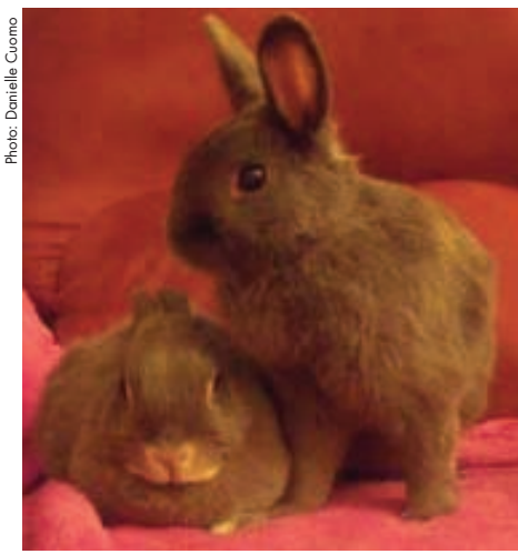
Addie with Hopper