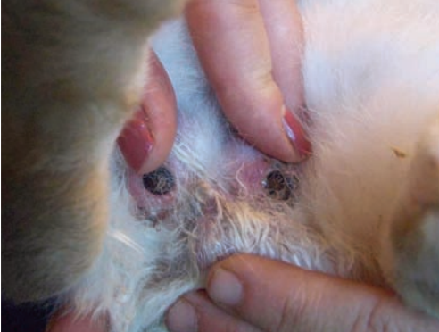
Not cute: Two cuterebrae were embedded in poor Hugh's scrotal sacs.