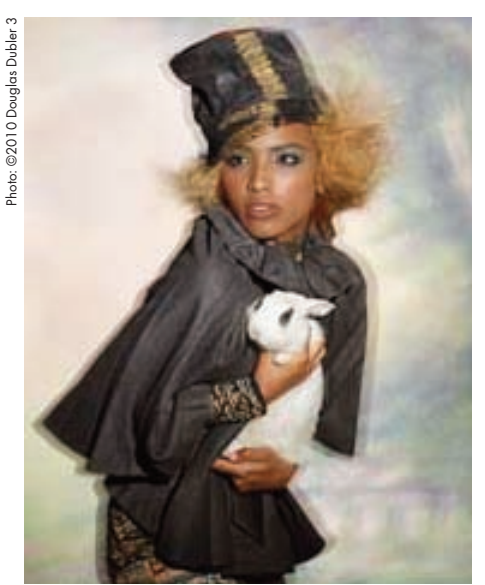
Ace, also known as Doc and now named Davey, was featured in a "Mad Hatter" fashion shoot this summer.

As it turns out, Doc had checked into our hospital under an assumed name. Using the skills I honed as a detective, I