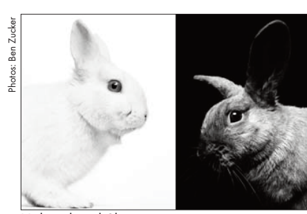
Halyard and Sherpa