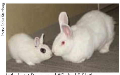
Little hotot Davey and "Goliath" Skittles.

It didn't occur to me that Skittles, who is close to eight pounds, and Davey, closer to