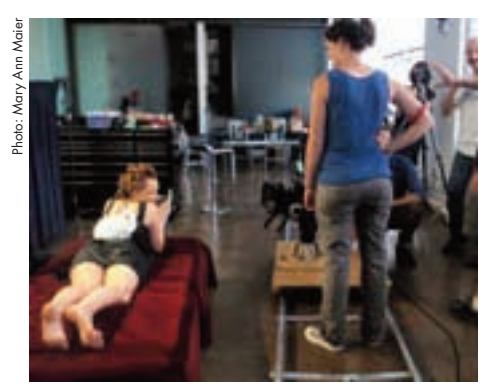
Long Island foster rabbit Lucky on set between video takes.