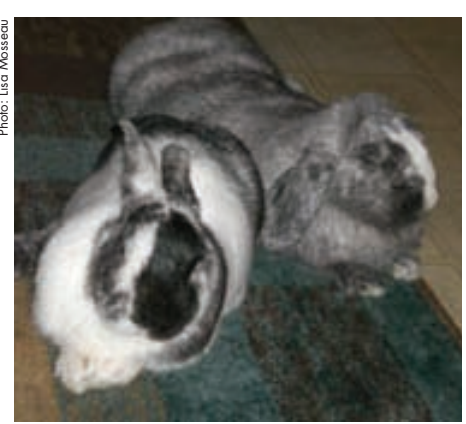
Bailey and Sambuca

first. Bailey has a bum leg and I thought he would sometimes hit me in the head with it on purpose. But of course that wasn't the case. Plus, I still wanted to rule the apartment and show him who was boss. But soon enough, we were able to have dates that lasted long enough for us to really get comfortable with one another. The first day we were left on our own, we didn't know what to do with each other. It was exciting.