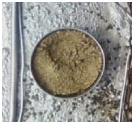
Top, the front of the rooftop, facing Bleecker Street. The rabbit easily could have hopped off the roof, plunging six stories to her death.

Middle, this was an apparent attempt to construct a rooftop rabbit shelter. It consisted of a piece of plastic tarp over a box, held down by bricks. Bottom, these mushy pellets were evidence that someone intentionally put the rabbit on the roof. There was no fresh water.