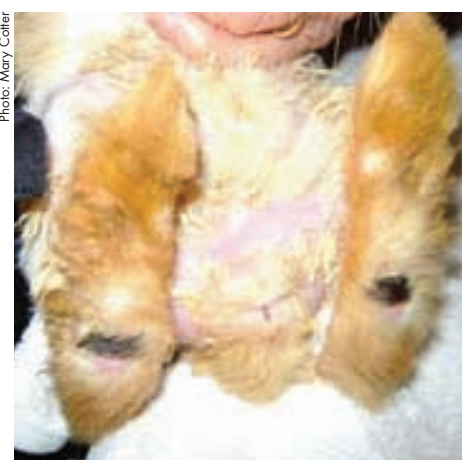
Sept. 19, 2010. Scabs on hocks

She rocks back on her heels to keep her weight off those sore spots in the middle of her hocks.