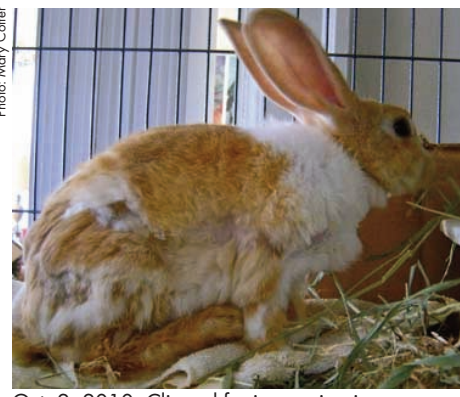
Oct. 2, 2010. Clipped fur is growing in.