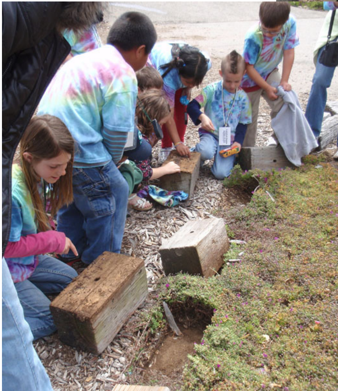
Baywood Elementary School first graders engaged in an activity called “Who lives under this log?” during their insect walk in the Elfin Forest.

Please report any interesting sightings to your Oakleaves editors at: oakleaves@elfin-forest.org for inclusion in future issues under “Elfin Forest Sightings.” You can also leave a message on SWAP’s answering machine, (805) 528-0392.