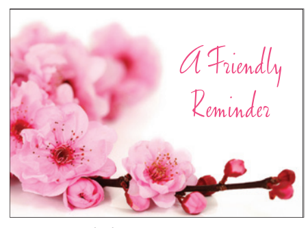
030-8718, Standard Message 030-9039, Custom Message 030-9351, 4-Up Laser