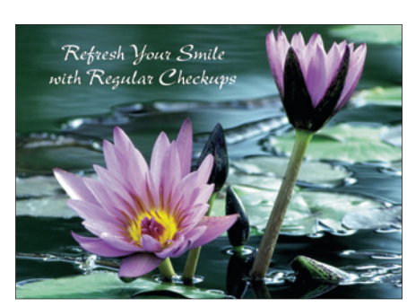
071-7108, Standard Message 072-7933, Custom Message 053-1764, 4-Up Laser