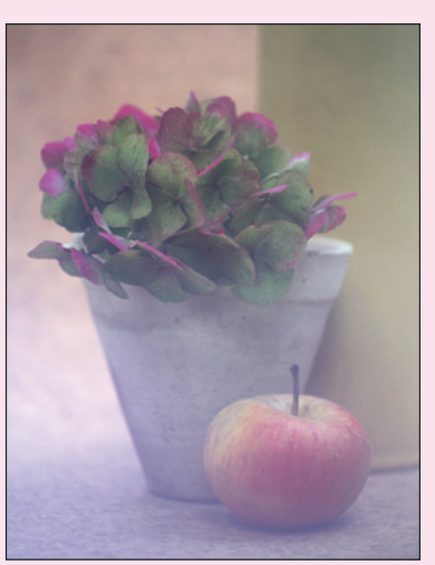
065-0002, Get Well Inside Message: Because we care about how you're feeling 065-0085, Blank; Envelope: White