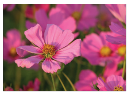
013-8891, Standard Message 013-9253, Custom Message 013-9618, 4-Up Laser