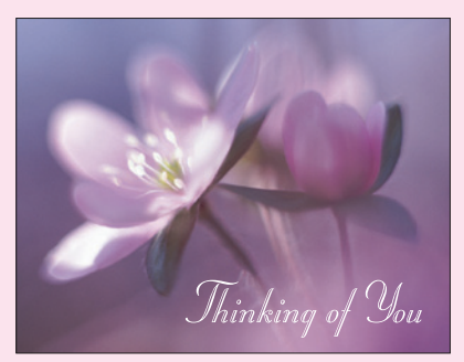
081-7346, Thinking of You Standard Message: Your choice from message group B or D; Personalization: Up to 3 lines; Ink Color: Black; Envelope: White