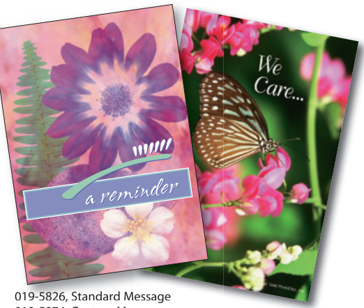
019-5974, Custom Message 019-6063, 4-Up Laser