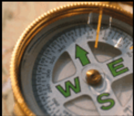
Chart your world.