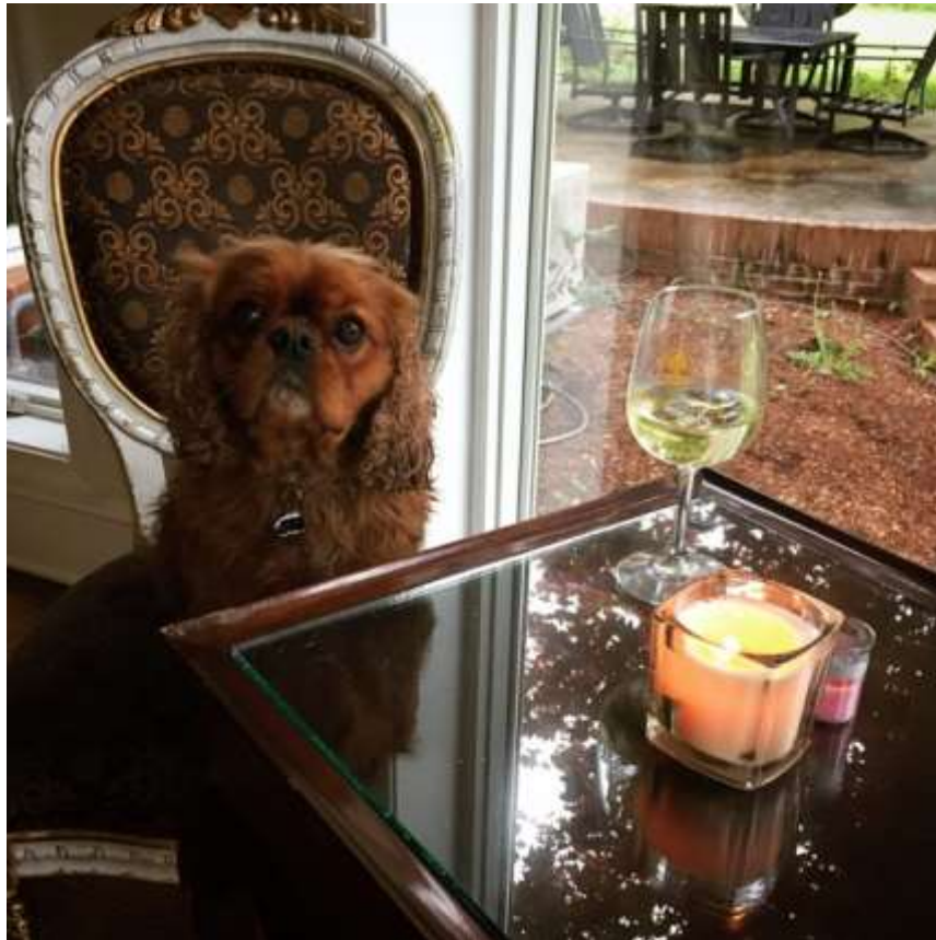
Date Night. Bark Post Stories