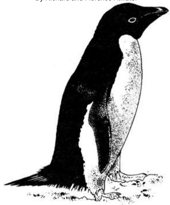
Chapter III Out of the Antarctic Pages 15-21

Write either True or False in the blank before each statement.