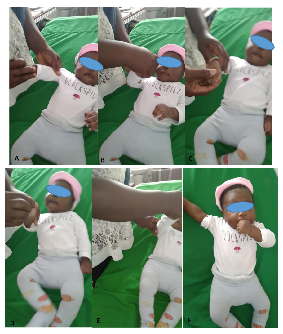
Figure 2. "NCRDP self-rehabilitation protocol" executed by the mother of this girl. (A): elbow extension; (B): elbow flexion; (C): wrist flexion; (D): wrist extension; (F): shoulder circumduction; (G): shoulder abduction.

first group consists of passive, gentle, repeated and systematic mobilization of the shoulder, elbow, wrist and fingers, regardless of age and lesion type of OPBP. Flexion and extension movements are reserved for elbows, wrists and fingers while at the shoulders, abduction movements, antepulsion, internal and external rotation, time and counter-clockwise circumductions are applied. Sessions of 15 to 20 minutes at least 08 times per day were encouraged to avoid parents having to practice long sessions of several hours in a row. The second group of exercises includes tactile sensory stimulation by the outcrops and caresses of the injured limb. The third group, for infants aged at least of 3 months, includes fun interactive activities with colorful and sound toys (rattles, balls, ...) and light balloons to stimulate recovery through bimanual gripping.