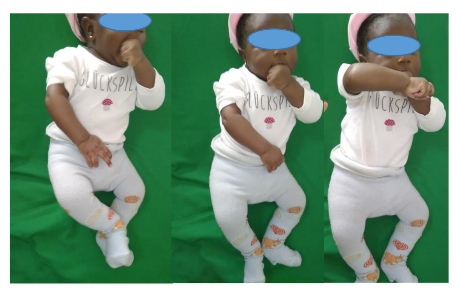
Figure 1. Incomplete active motion in Erb's palsy in a 3 months old girl.

The rehabilitation protocol by the parents, developed by a team of orthopaedic surgeons and physiotherapists of the NCRDP and which we will call in the rest of the text "NCRDP self-rehabilitation protocol" ( Figure 2 ), was explained to them from the first consultation. It consists of three groups of exercises. The