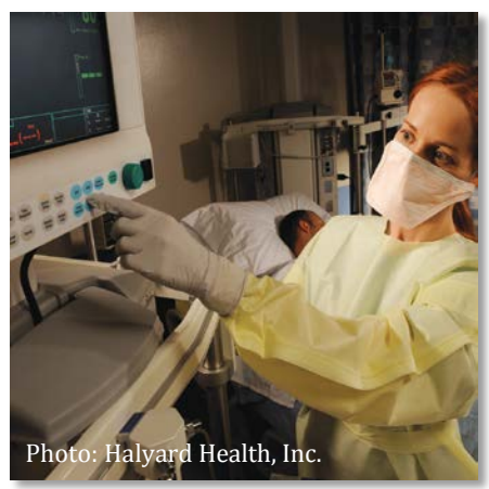
Nurse wearing a filtering facepiece N95 respirator.