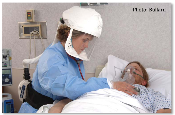
Nurse caring for patient while wearing a powered airpurifying respirator.

The ATD Standard requires employers to provide and ensure that employees use respiratory protection (respirators) whenever an employee: