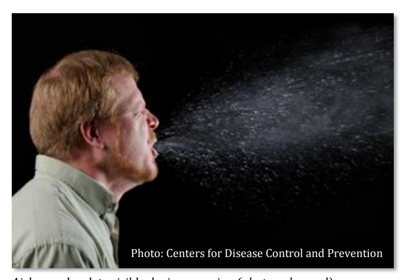
Airborne droplets visible during sneezing (photo enhanced).

An aerosol transmissible disease ( ATD ) is a disease that can be transmitted by either 1) inhaling particles/droplets; or 2) direct contact between particles/droplets and mucous membranes in the respiratory tract or eyes.