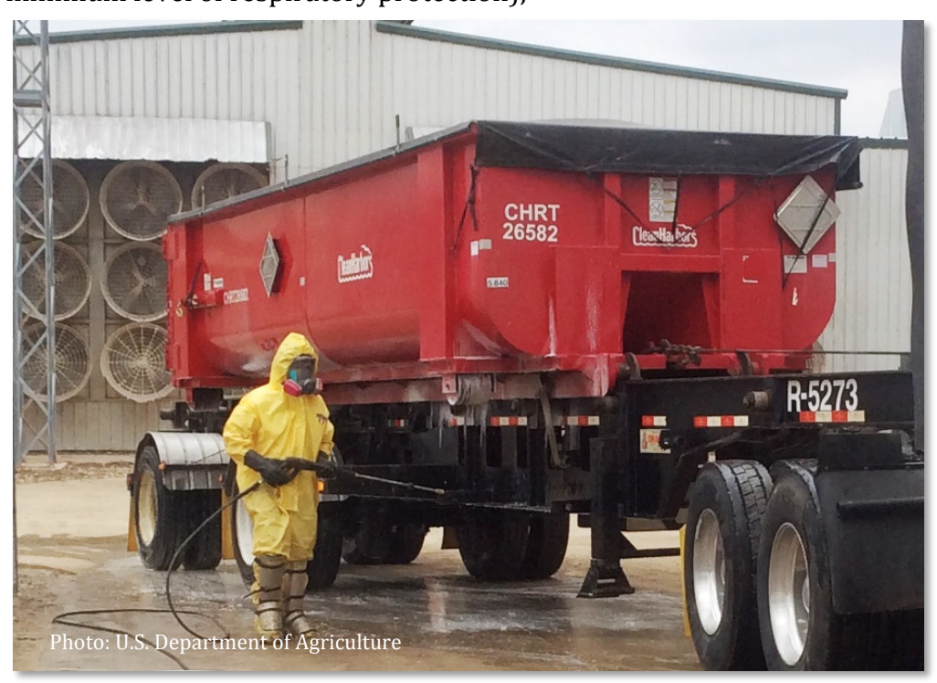
Avian influenza responder wears PPE while decontaminating equipment before it leaves the site.