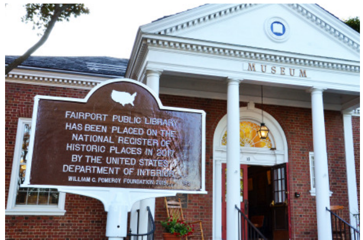
Provided through a grant of the William C. Pomeroy Foundation, the beautiful new historic marker is a welcome addition to the grounds of the Fairport Historical Museum.

The museum was open for only one year when an energetic group of volunteers emerged to care for the gardens at the former library. The Greenbrier Garden Club initially had the help of Boy Scouts in 1980, when many of the beds that still adorn the rear yard were first created. For thirty-nine