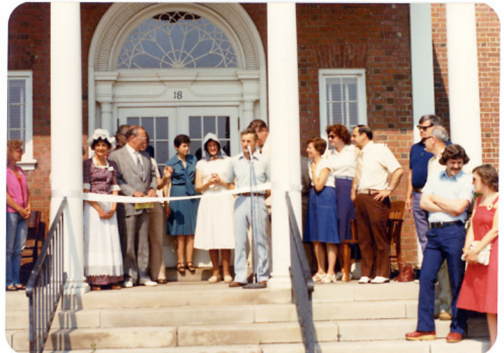
A ribbon-cutting ceremony marked the grand opening of the Fairport Historical Museum in June of 1979, and was attended by local dignitaries and Congressman Frank Horton.