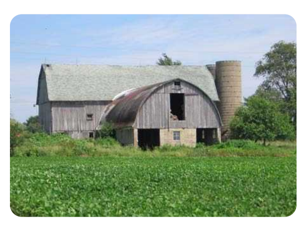
Springfield Bog Metro Park | circa 2010

forested areas within this park. The Young family raised dairy cows and farmed this land for over 100 years. They grew crops like corn, wheat, oats and grass for hay, while natural bogs on the property produced huckleberries. In the early 1900s, a railroad spur was built to the Youngs' farm to deliver city dwellers to the farm for berry picking. Sitting on the continental divide, the land has since been returned to its natural prairie habitat by the park district.