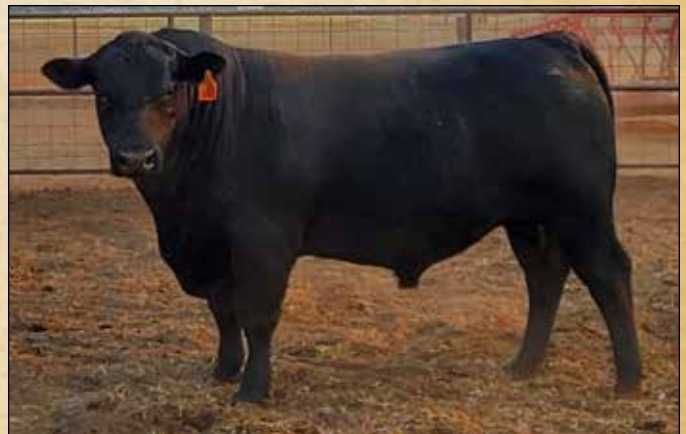
Sunbright Power Source G75