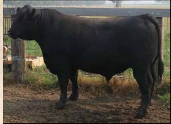
Tara's Acclaim G26