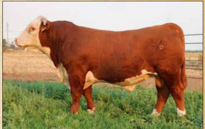
Lambert Catapult 251F