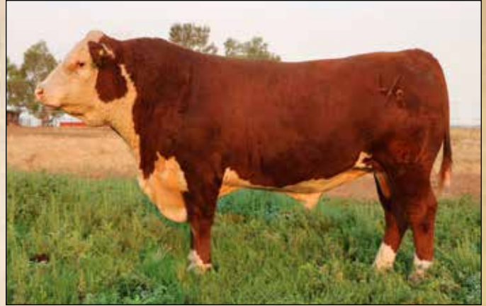
Lambert Catapult 191F