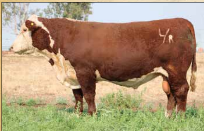
Lambert Gunslinger 83G