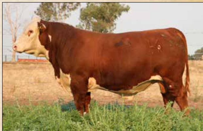
Lambert Gunslinger 51G