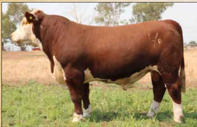
Lambert Slingshot 69G