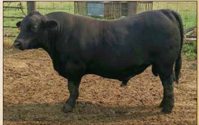
Tara's Sky High G6