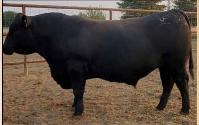
Sunbright Treasure G114