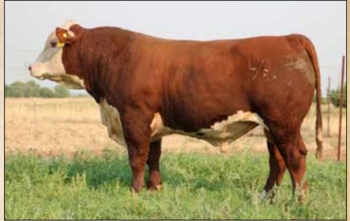
Lambert Gunslinger 33G