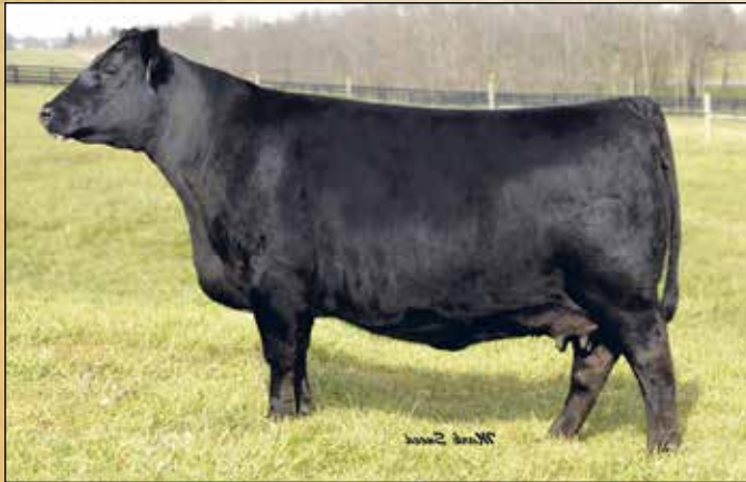
Boyd Everelda Entense 910 — Grandam of Lot 61