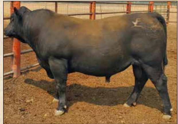
Sunbright Power Source G826