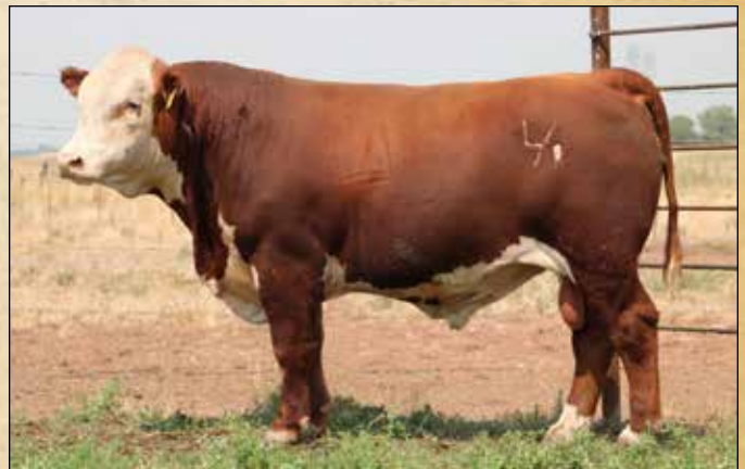
Lambert Slingshot 19G