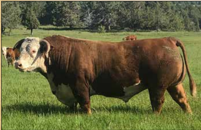
XAMR Ribstone Domino 613 — Sire of Lot 29