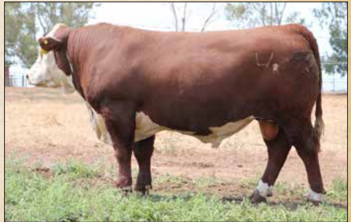
Lambert Slingshot 153G