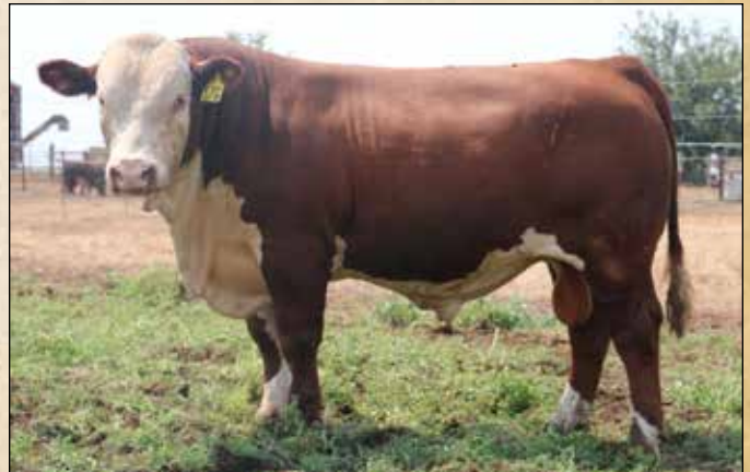
Lambert Slingshot 17G