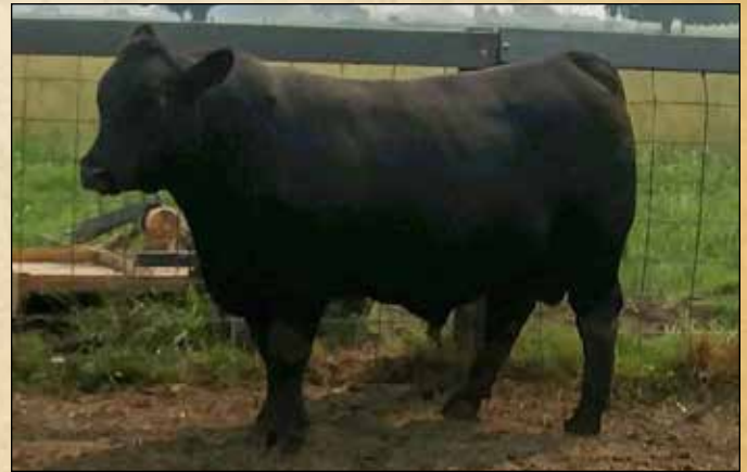
Tara's Sky High G14