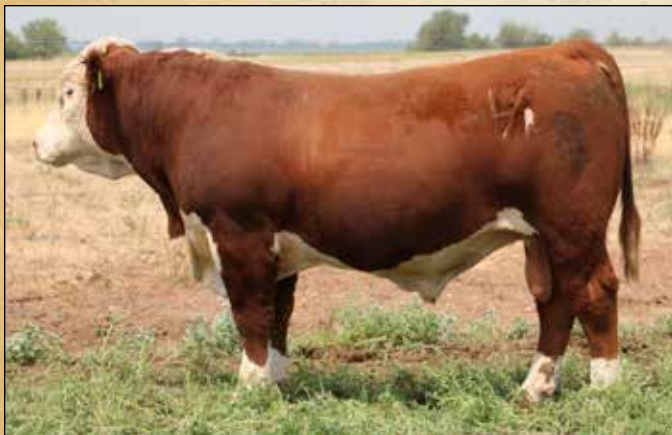
Lambert Gunslinger 135G