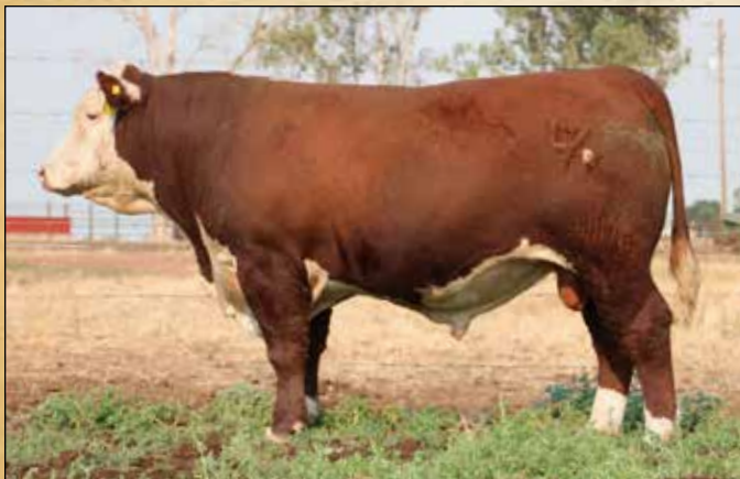
Lambert Slingshot 27G