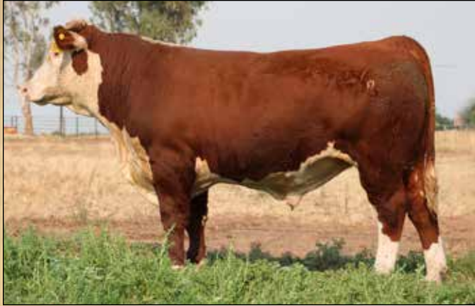
Lambert Slingshot 129G