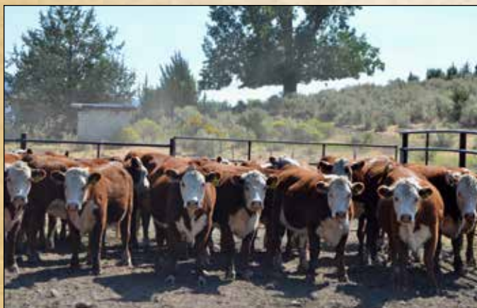
Lambert Ranch Bred Heifers