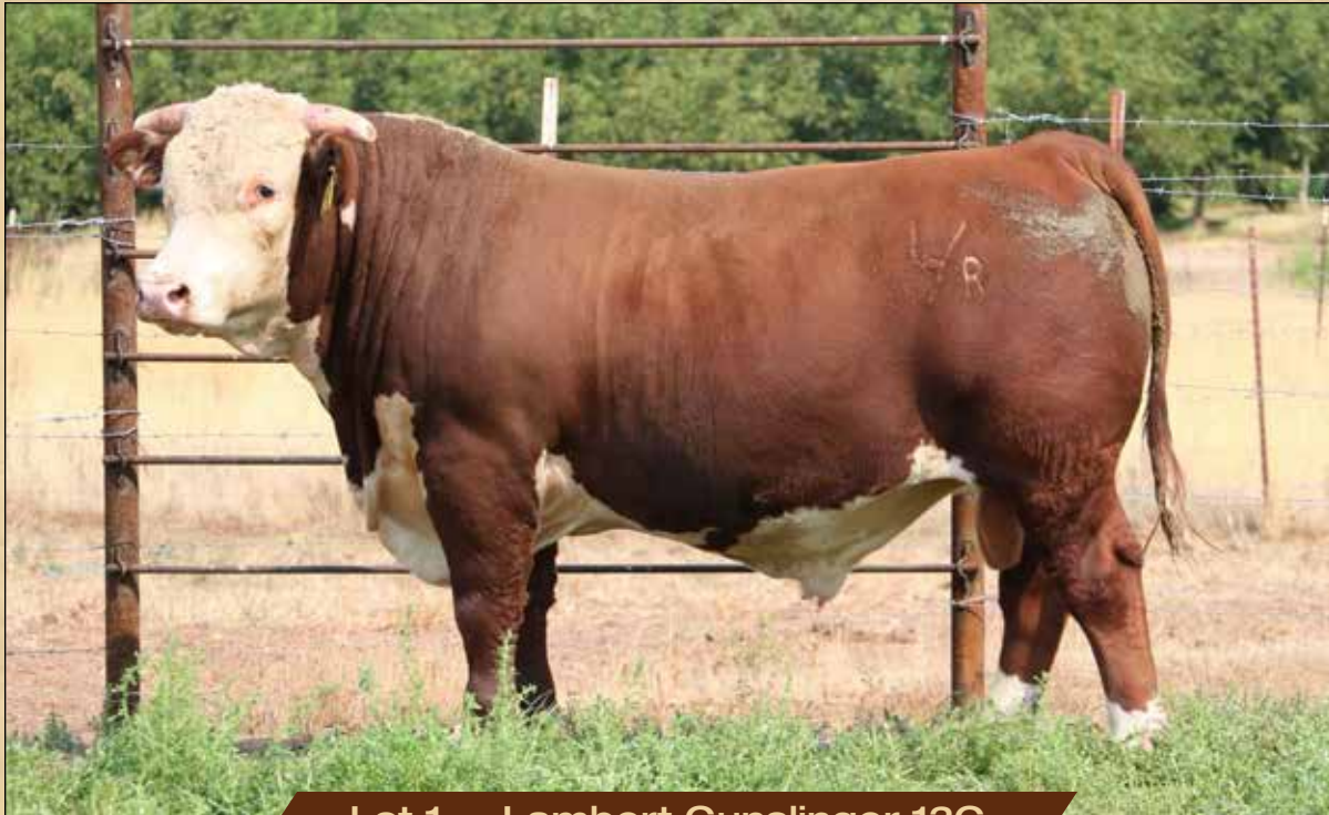
Lot 1 — Lambert Gunslinger 13G