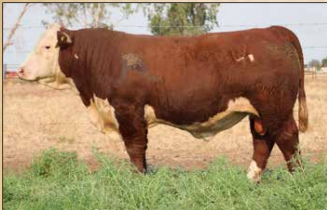
Lambert Ribstone Domino 39G