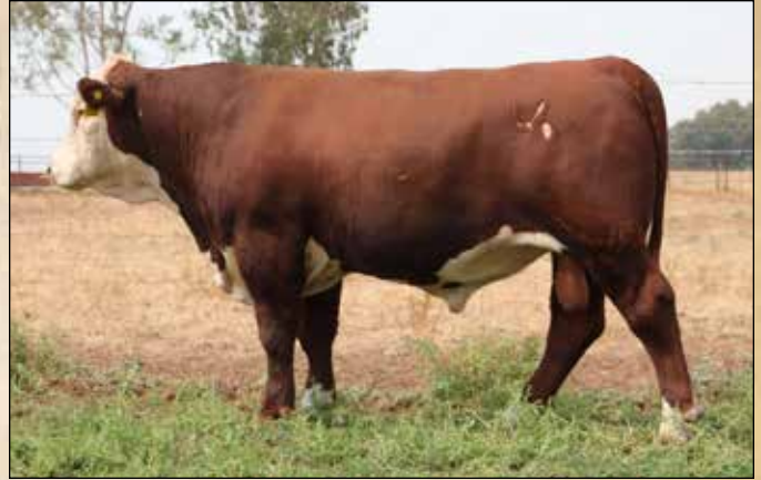
Lambert Contractor 107G

CRR 719 CATAPULT 109 (SOD)(DLF,HYF,IEF,MDF) CRR 734 ECLIPSE 909 (DOD)(DLF,HYF,IEF) SB LR 61N DONE RIGHT 31X ET LAMBERT CARISSA 2030 82R (DOD)