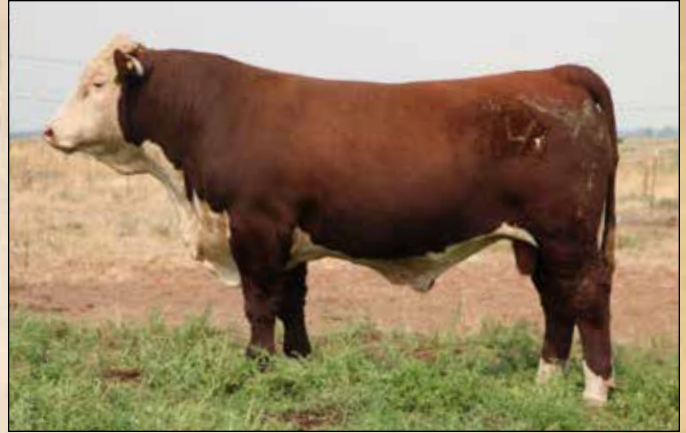
Lambert Ribstone 147G