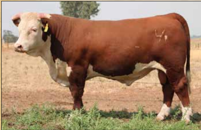
Lambert Slingshot 25G