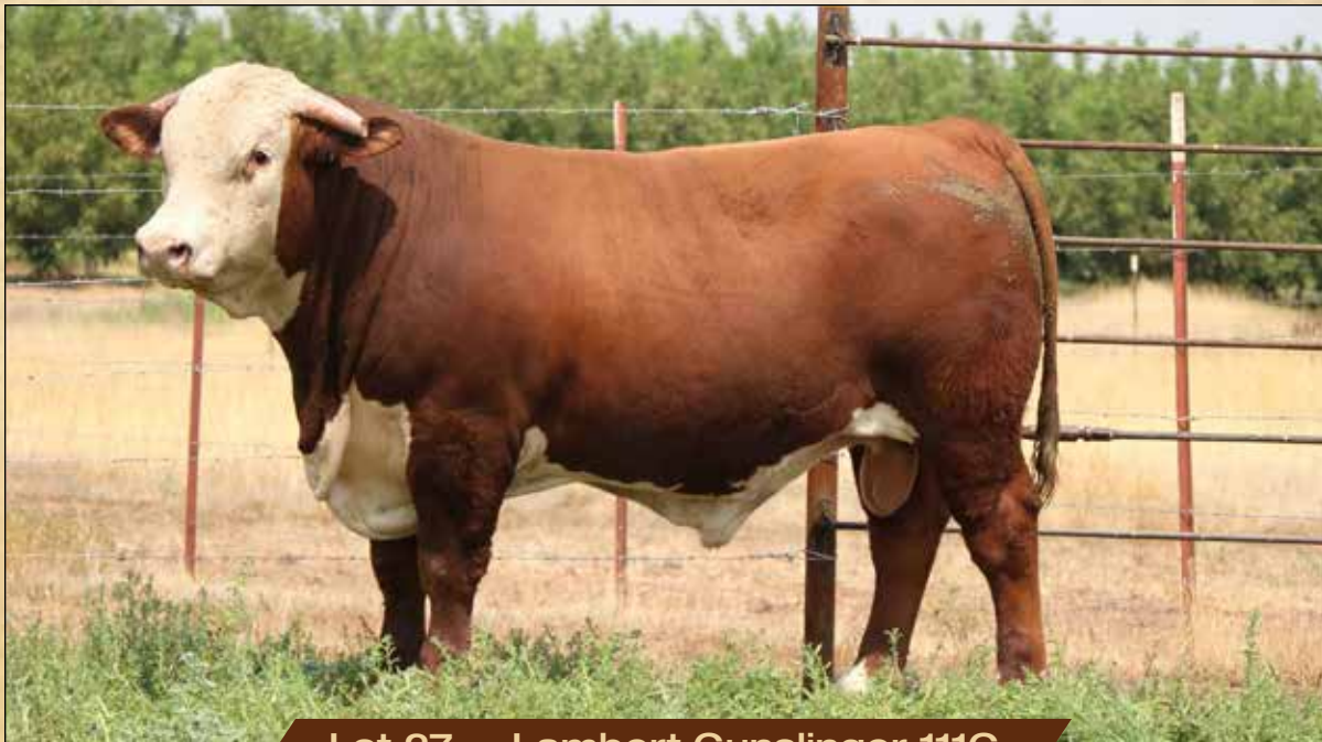
Lot 27 — Lambert Gunslinger 111G