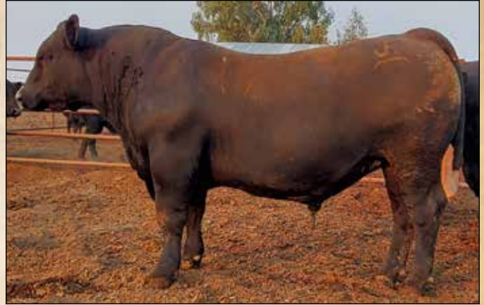
Sunbright Power Source G16