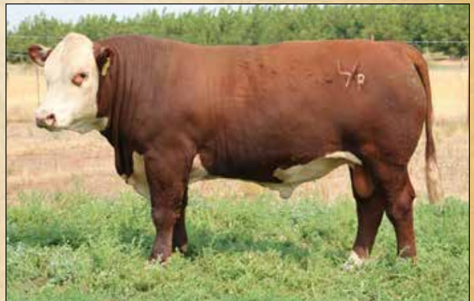
Lambert Gunslinger 37G