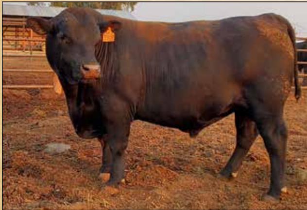
Sunbright Treasure G92