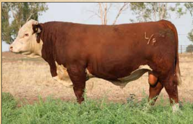
Lambert Gunslinger 43G