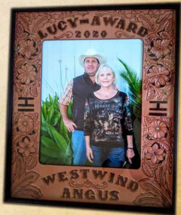
Westwind Angus 2020 Lucy Award