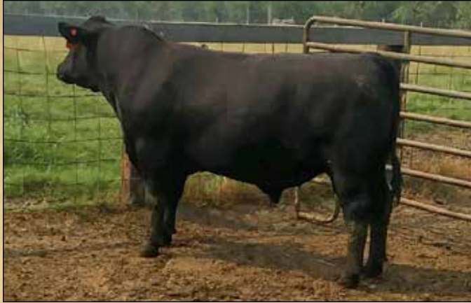
Tara's Legendary G20