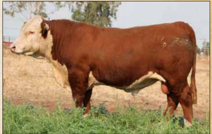
Lambert Slingshot 89G