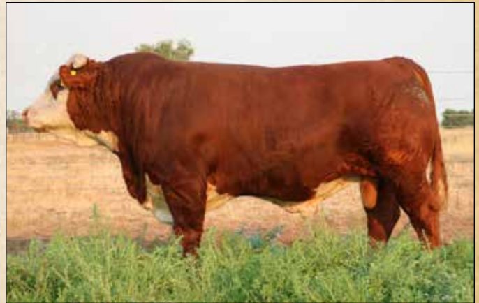
Lambert Catapult 195F