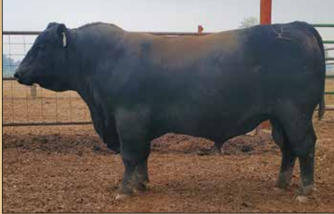
Sunbright Sky Hight 2G1