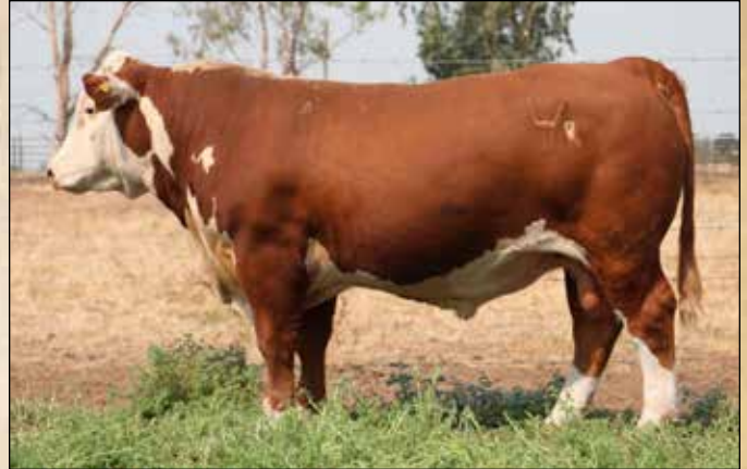
Lambert Gunslinger 15G