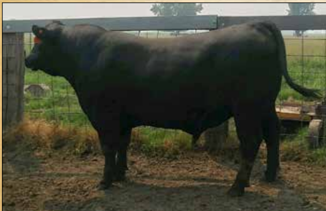
Tara's Acclaim G5