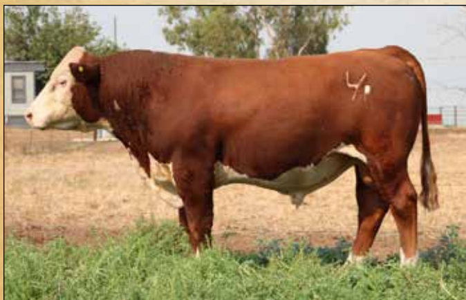
Lambert Gunslinger 47G