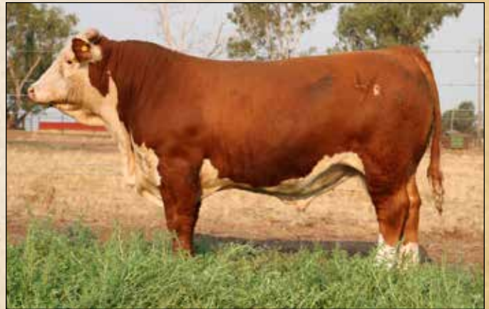
Lambert Slingshot 35G