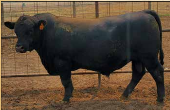
Sunbright Treasure G206