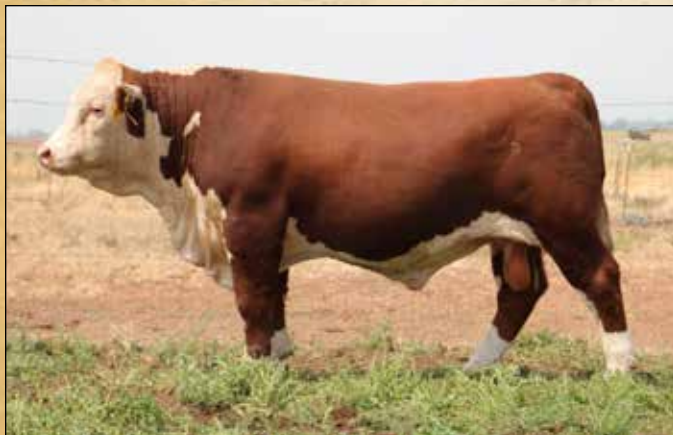
Lambert Slingshot 7G