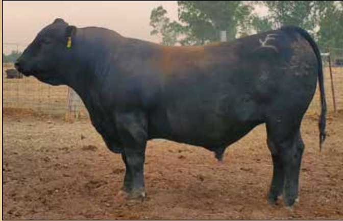
Sunbright Power Source G631