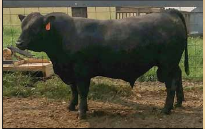
Tara's Complete G64