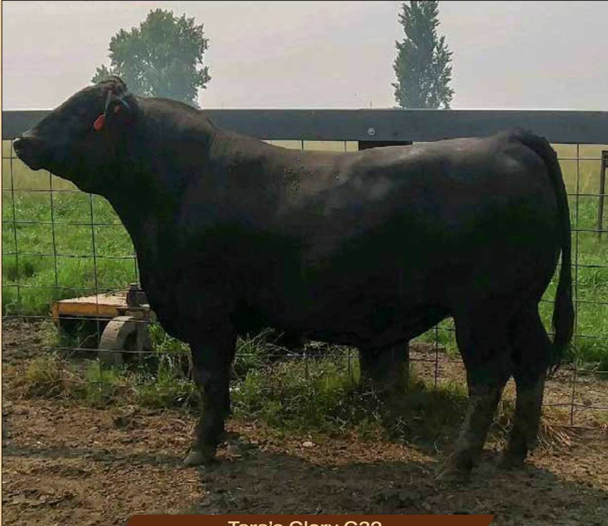
Tara's Glory G32