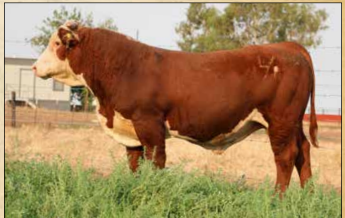
Lambert Gunslinger 169G