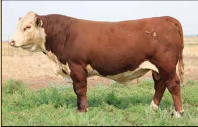
Lambert Gunslinger 21G