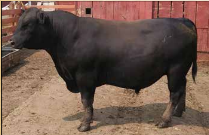
Tara's Legendary G821