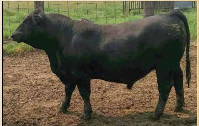
Tara's Complete G61