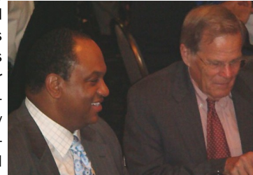
East Tennesseans open their hearts to victim's of abuse