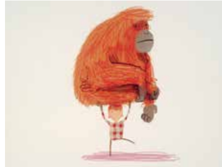
Oliver Jeffers, An orang-utan to knock down the milkman... , 2011