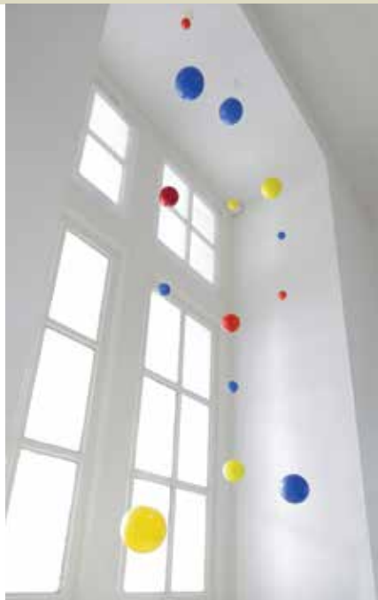
Lisa Murphy, Colour sphere rating system for consumer responsibility, 2012. Wire mesh, 0.12mm nylon fishing line, polystyrene balls, 3.0g lead weights

Booking is essential for all talks. Free tickets are available on line at www.imma.ie/talksandlectures .