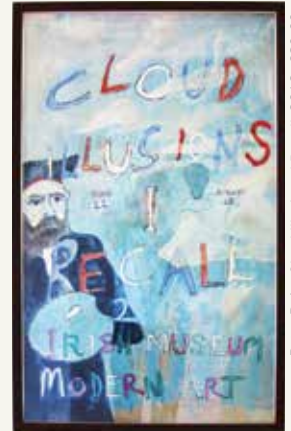
Peter Doig, Cloud Illusions / Recall , 2013, €80.00.

There are over 40 to choose from. IMMA Limited Editions can be viewed and purchased online at www.immaeditions.com