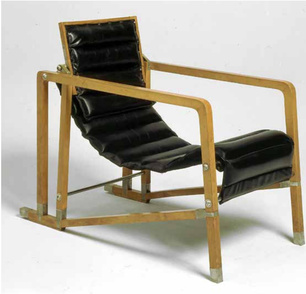
Eileen Gray, Transat chair , circa 1926-1929, Varnished sycamore, nickel-plated steel, synthetic leather. Piece of furniture from the E1027 villa. Centre Pompidou, Musée national d'art moderne, Paris. Purchase, 1992