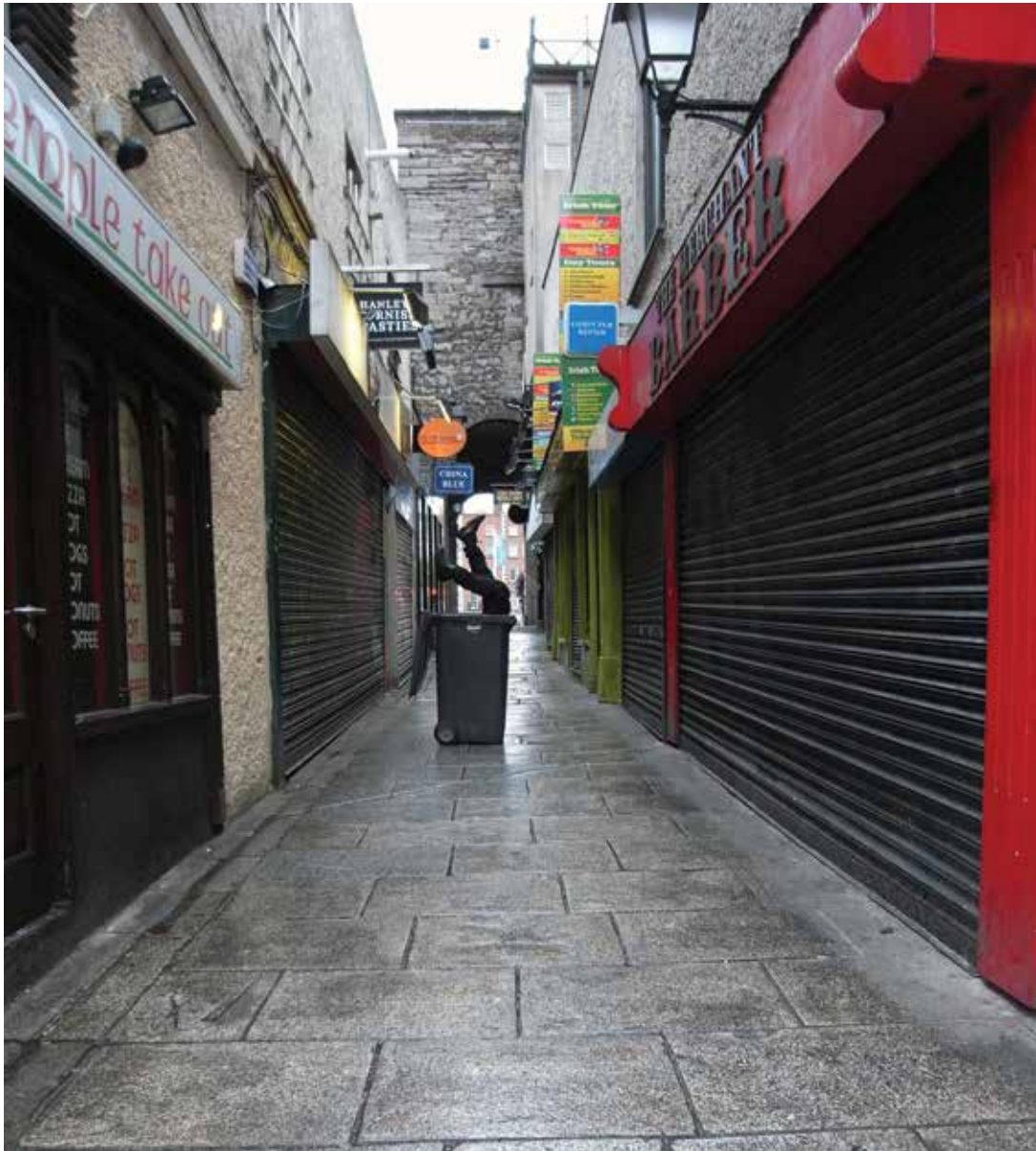
Klara Lidén, Merchants Arch , 2013, C-print, 60 x 45 cm