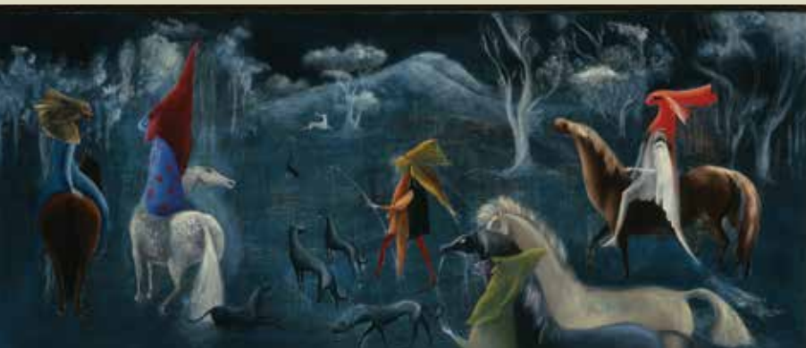
Leonora Carrington, Untitled (pour Jahoe et Jean François), 1952, oil on masonite, 30 x 72.3 cm, Private Collection