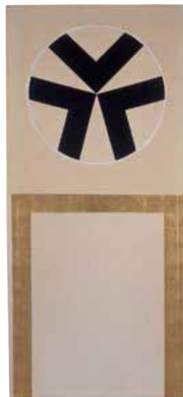
Patrick Scott, Gold Painting 47 , 1969, Oil and gold leaf on linen, 178.2 x 81.8 cm, Collection Irish Museum of Modern Art, Donation, Gordon Lambert Trust, 1992

The Artists' Residency Programme is re-commencing in January 2014 when we bring artists back to live and work onsite at IMMA. For further details visit www.imma.ie