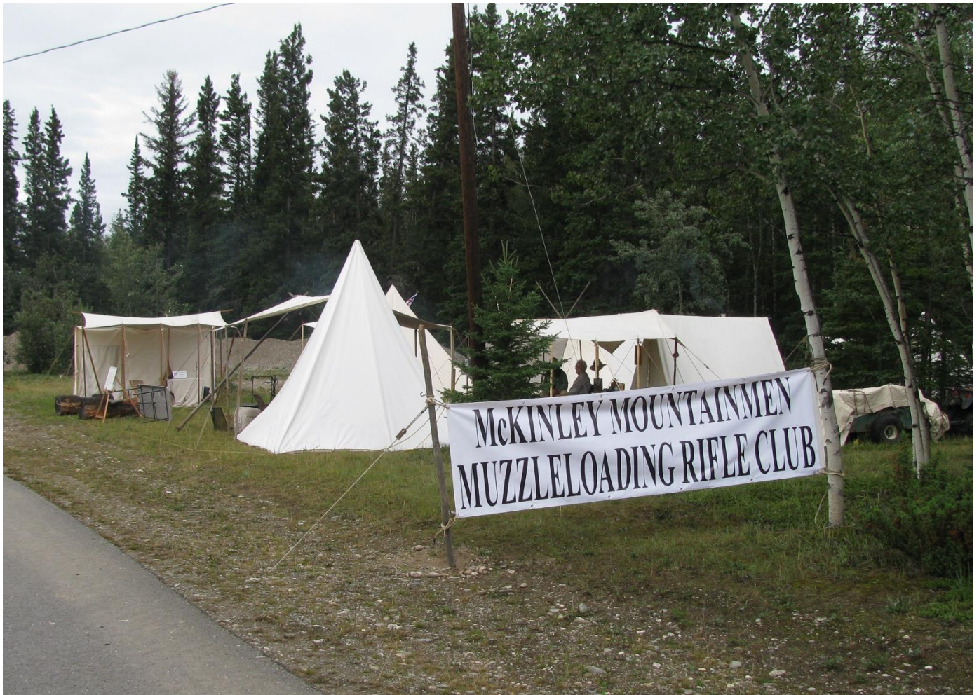
Our Primitive Camp Site at the Deltana Fair