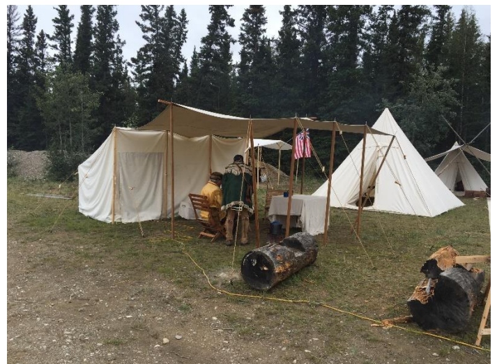
Primitive Camp Life on Display for Fairgoers