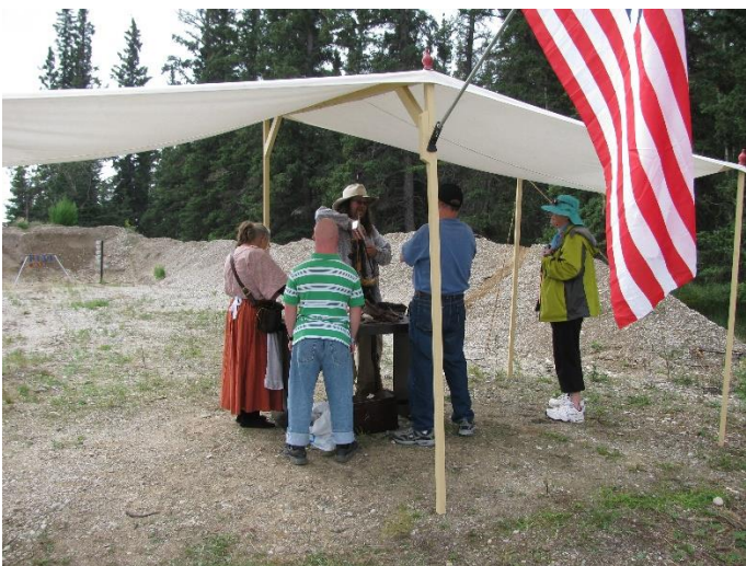
Our Range & Muzzle Loader Instructions