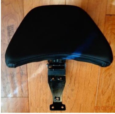
2018+ Goldwing Tour stock seat rider's backrest, MSRP $278.55, asking $100.

Items for sale, contact Brian Richards, 865-249-6173 or barljr@att.net , NOTE, I have reduced several of the prices, so anything you think you might be interested in, recheck, and negotiate!