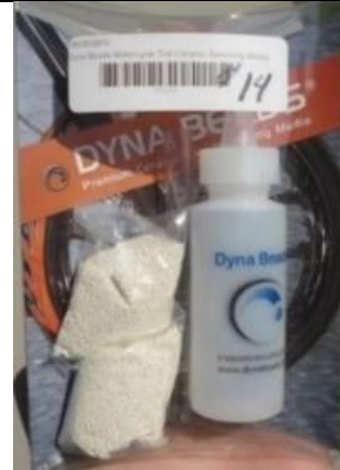
Dyna Beads for tire balancing, new, (with TPMS system in our bike, we can't use these), asking $10