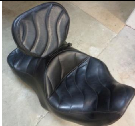
Hartco custom vinyl seat, heated, with rider backrest, matching co-rider backrest cover, rider's backrest storage pouch, new heating element and refreshed rider's seat foam done by Hartco, fits GL1800 2012-2017, original MSRP $1,500, asking $400.00/OBO