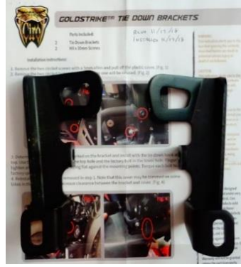
2018+ Goldwing "Goldstrike" tie-down brackets, MSRP $50, asking $20.