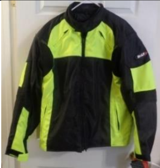
Bilt Spirit H2O jacket, lady's size large, brand new, MSRP $299.99, asking $50.