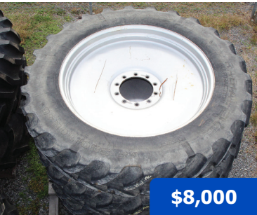
(4) Firestone Row Crop Tires and Rims, 380/90R46, white, with 1 in. offset. (PA)