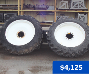
(2) Goodyear Row Crop Tires, 380/90R46, white, with 1 in. offset. Brand new! (PA)