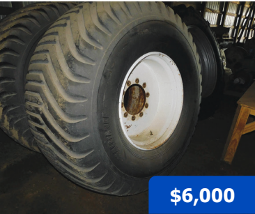
Alliance Turf tires, (4) Alliance turf tires. Will fit any Prowler. 850/50-30.5. (Sikeston, MO) BROKERED