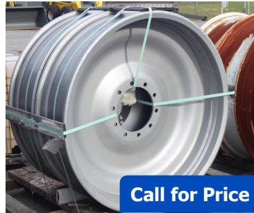
(2) Rims 12x46 in., heavy bead gray, W46-03500P15. Brand new! (PA)