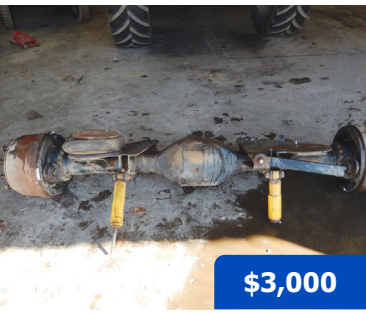
AxleTech Rear Axle, complete 99 in. rear axle. SN: 00054 (Landisburg, PA) BROKERED