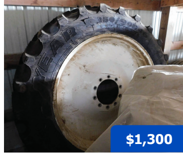
Goodyear Ultra Sprayer Tire, (1) new Goodyear Ultra Sprayer tire with 1 in. offset wheel. 380/90R46. (Sikeston, MO) BROKERED