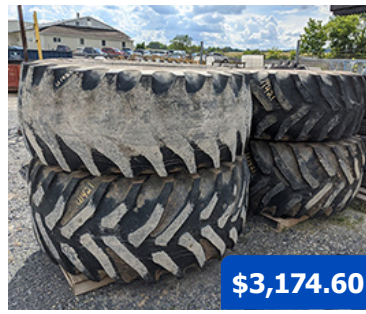
Goodyear Tires, (2) 650/75R32 (5% remains), (2) 800/65R38 (15% remains), white rims. (PA) No. U1421