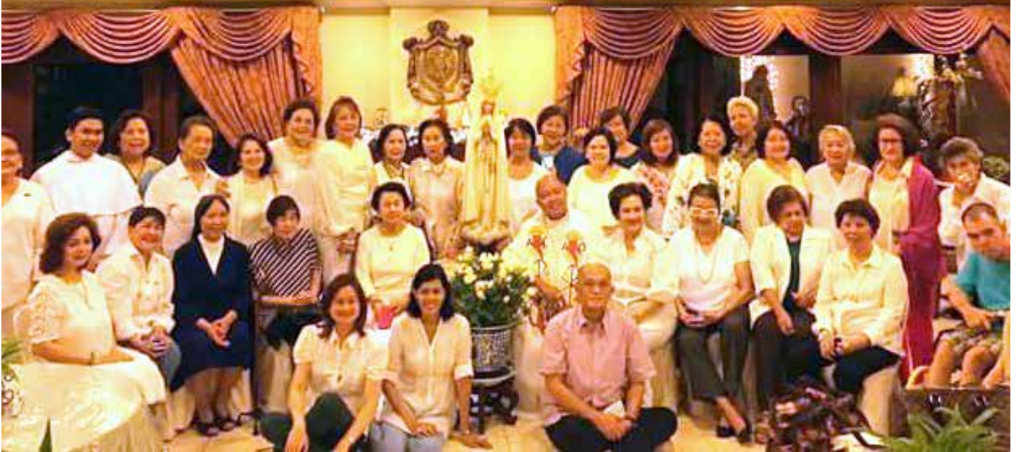
Members of the SSAP-Marian Cenacle

2017 is a spiritually remarkable year to Marian groups like the SSAP Marian Cenacle. We celebrate the 100 th Anniversary of the Apparition of the Blessed Mother in Fatima, Portugal. During such Feasts, Cenacle members attend the prayer meetings dressed in white or blue. Before Mass, each one offers a rose before the Fatima Image which was blessed by Pope Francis in 2015 during his encounter with families at the SMX Arena.