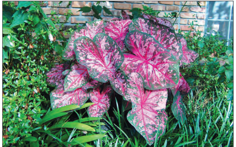
Heart-shaped caladiums (above) are a classic in the Southern landscape. Caladium tubers (below) come in sizes from mammoth to size 3.

Store clean, dried tubers spaced apart from one another in a cool place in a paper bag, cardboard box or other breathable material.