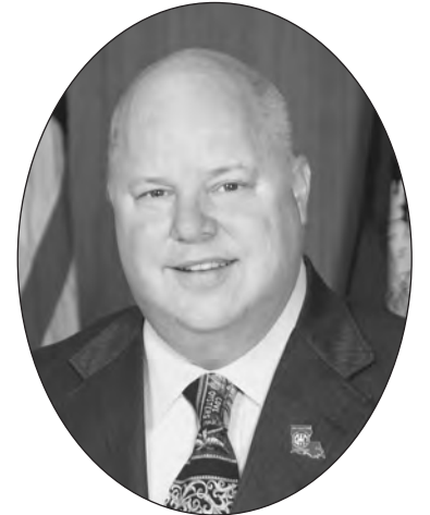
MIKE STRAIN DVM COMMISSIONER

The 2020 Second Extraordinary Session adjourns on October 27, 2020.