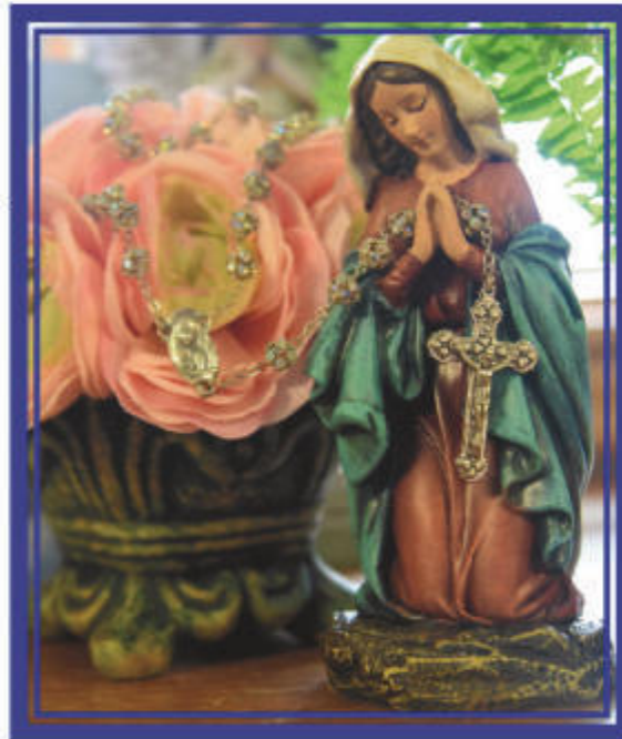
Rosary and statue of Mary available in our Gift