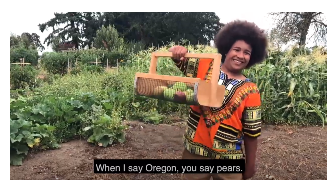
An English language version of the Pears video .

The month of August brings new additions to the Oregon Harvest for Schools (OH4S) video series. Spanish language versions are coming soon!