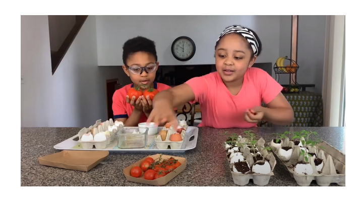
An English language version of the Tomatoes video .

Oregon Department of Education Child Nutrition Program's and OSU Extension's Food Hero campaign have teamed up to launch this series which will include a total of 50 videos when complete. The series aims to educate students on healthy, Oregon food. For a comprehensive list of the videos we have available to date visit the <a href="Oregon Harvest for Schools website">Oregon Harvest for Schools website</a> and click on the Videos tab under "Other Items."