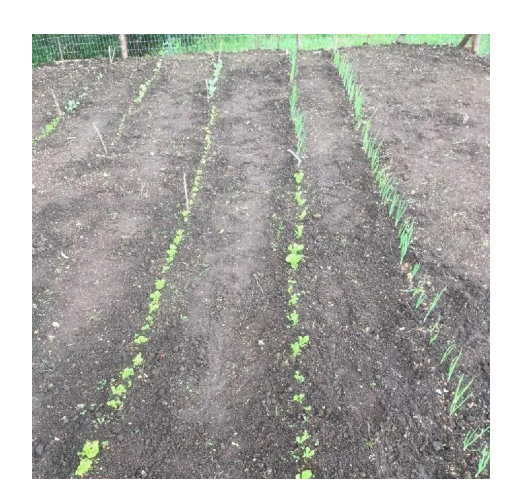
Chad, Bobbie and Cooper's #F2SAtHome garden planted with lettuce, radishes, and green onions.