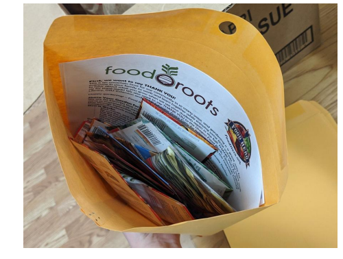
A peek inside one of the seed packages!

During the summer months Food Roots' Farm to School staff is growing food for school families in six different school gardens, and holding themselves accountable to the students they work with by reviewing their lessons, and internal selves, for inclusion, equity, and anti-racism.