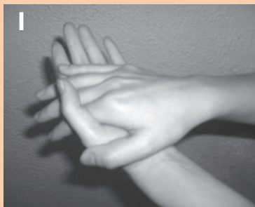
Rub hands palm-to-palm to create a lather