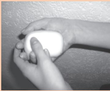
Rub soap on palms