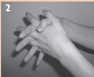
Rub hands together with the fingers interlaced