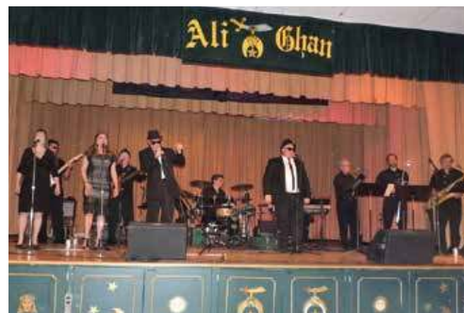
The "Blues Band" performs