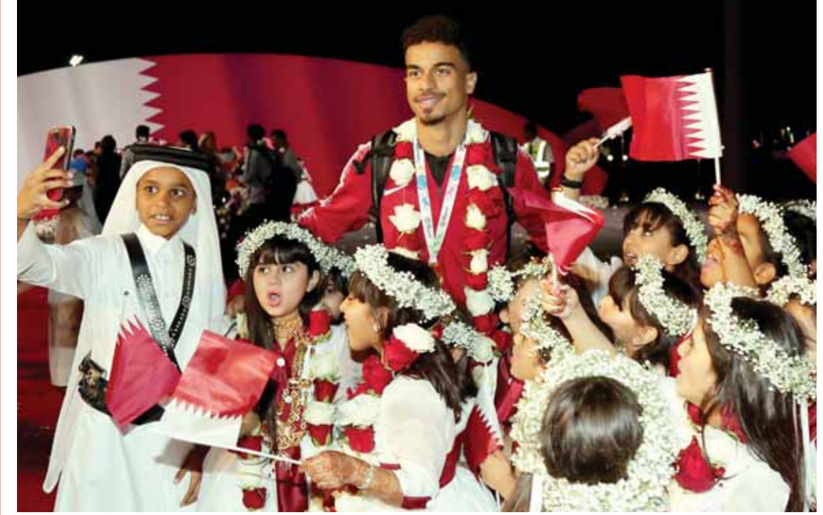
Akram Afif poses with a welcoming party of children.