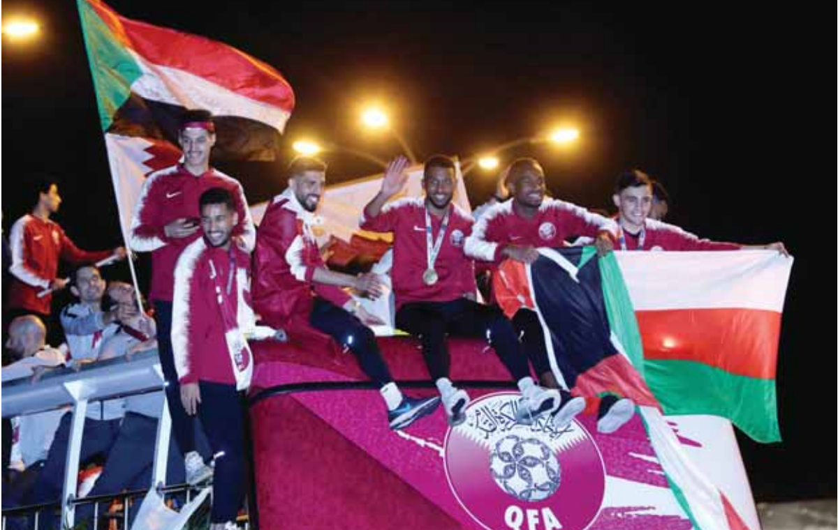
Qatar players celebrate with the flags of friendly countries.