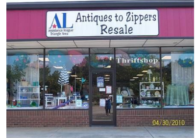
Our old space at 1689 N. Market.

The new year brought a new location for the A-Z Thrift Shop. After several months and countless volunteer hours to renovate the new larger space, the shop re-opened in March 2013 about half a block up from its old location. This new space provides almost 50% more floor space, better visibility from the street, a better loading dock area, and greatly improved parking for our customers.