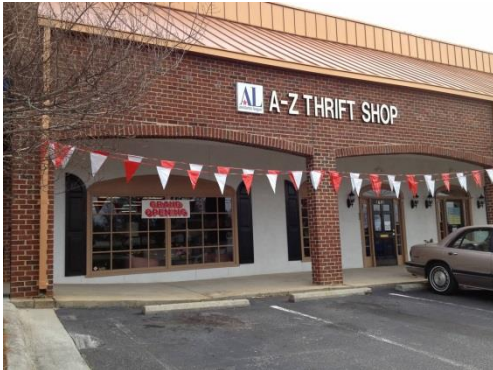
Our new shop at 1621 N. Market on the day of our Grand Opening.

The new year brought a new location for the A-Z Thrift Shop. After several months and countless volunteer hours to renovate the new larger space, the shop re-opened in March 2013 about half a block up from its old location. This new space provides almost 50% more floor space, better visibility from the street, a better loading dock area, and greatly improved parking for our customers.