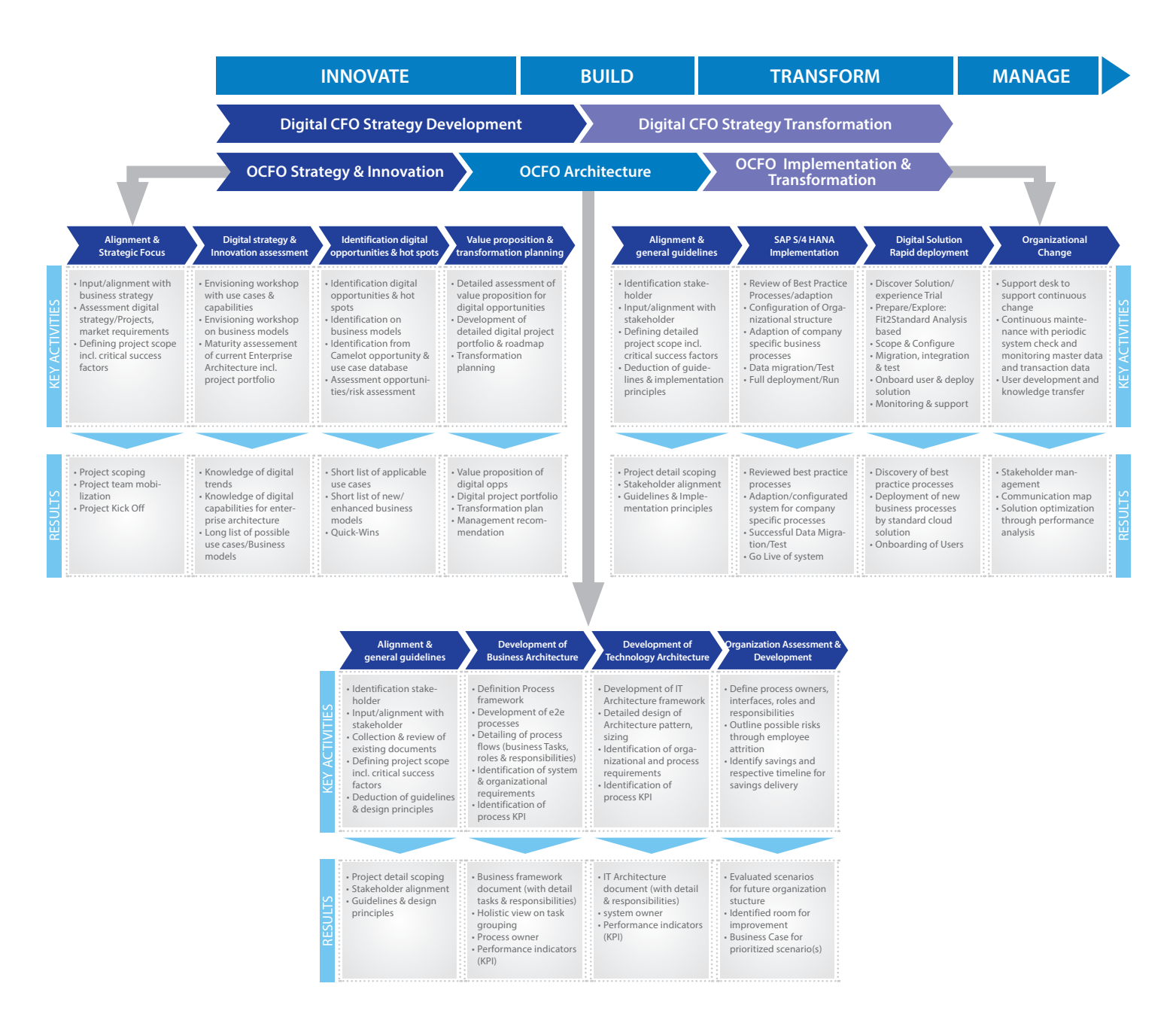
Figure 4: Infosys Consulting's Digital CFO Intelligent Enterprise Method

Our Digital CFO Intelligent Enterprise Method begins with an Innovate phase, where we evaluate and detail clients' high-level roadmaps, focusing on making your corporate vision a reality while laying a continuous improvement foundation.