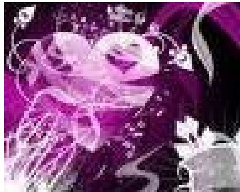
PURPLE HEART August 7 th