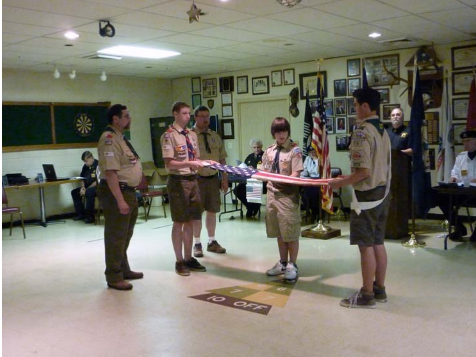
Left to Right

Due to the VEA State convention the lodge held it Flag Day ceremony on June 20 th . The lodge would like to thank Boy Scout Troop 761 for conducting the Flag Folding Ceremony and our Officers for conducting an inspiring program to celebrate Flag Day.