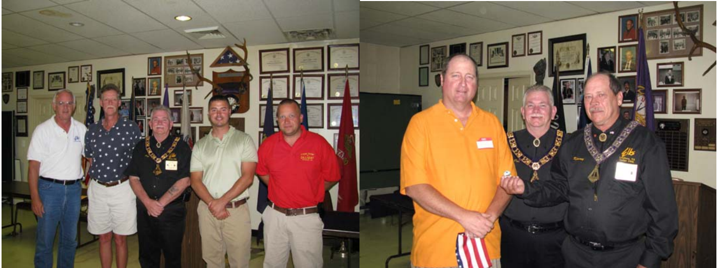
Left to Right

ON JUNE 5 th & 26 th THREE NEW MEMBERS were initiated into the lodge. Please be sure to welcome them and let's get them involved in our activities.