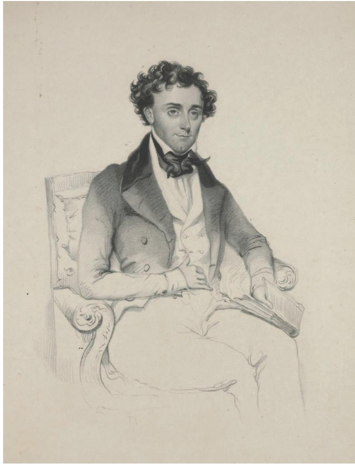
The blackface performer Thomas Dartmouth Rice (T. D. Rice), who pioneered the “Jim Crow” character, in a portrait from the mid-1800s.