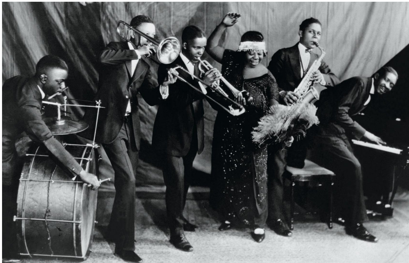
Ma Rainey, an early blues singer who performed in black minstrel shows, with her band.

before. What they saw caused a permanent sensation. He reportedly won 20 encores.