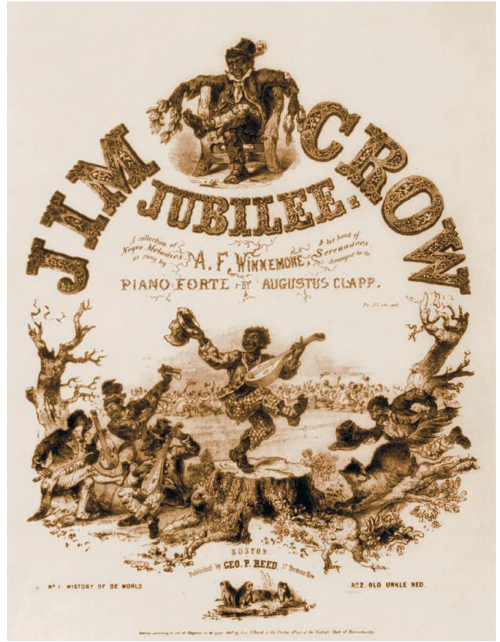
Sheet music of “Jim Crow Jubilee: A Collection of Negro Melodies,” published in 1847.

The truth is more bounteous and more spiritual than that, more confused. That confusion is the DNA of the American sound.