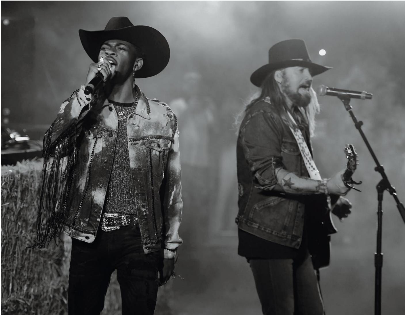
Lil Nas X, left, and Billy Ray Cyrus perform in Indio, Calif., in 2019.

fantasy. The song snowballed into a phenomenon. All kinds of people — cops, soldiers, dozens of dapper black promgoers — posted dances to it on YouTube and TikTok. Then a crazy thing happened. It charted — not just on Billboard’s Hot 100 singles chart, either. In April, it showed up on both its Hot R&B/Hip-Hop Songs chart and its Hot Country Songs chart. A first. And, for now at least, a last.