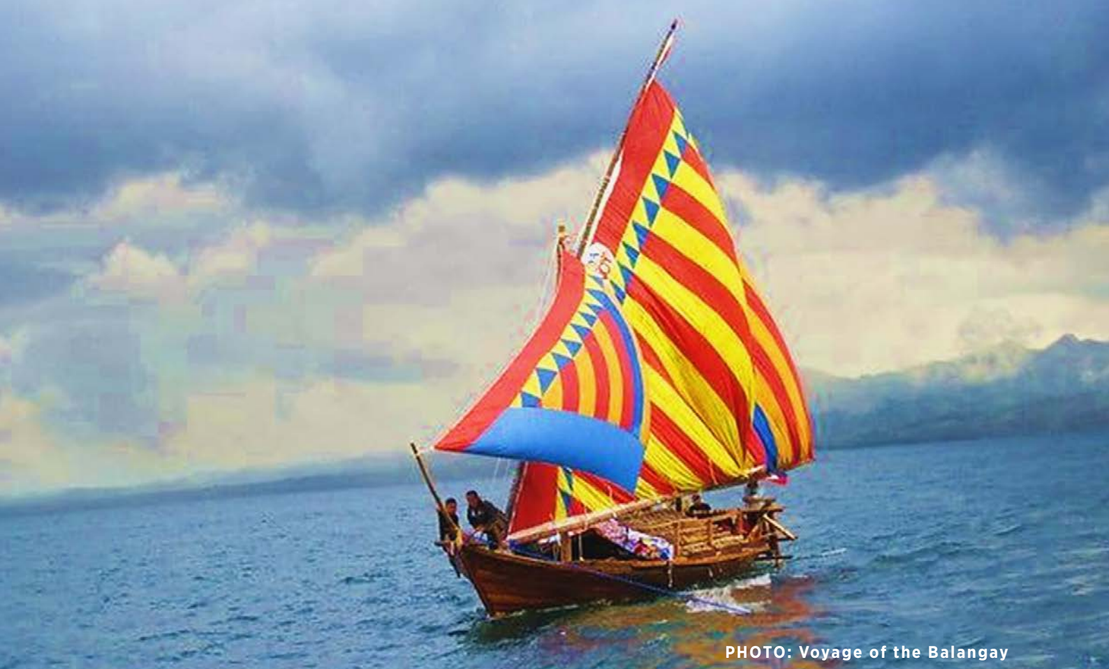
PHOTO: Voyage of the Balangay