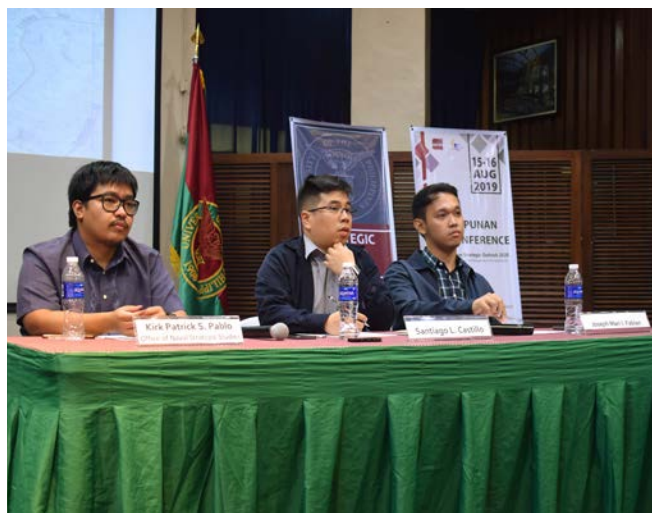
15-16 August 2019 – The ONSS presented its papers in the 4 th Katipunan Conference with the theme, “Strategic Transformations and Responses in the Asia Pacific”. The event was organized by the Strategic Studies Program of the UP Center for Integrative and Development Studies (UPCIDS). The Katipunan Conference annually gathers practitioners and academics engaged in the security sector and serves as a platform for the discussion of relevant security issues that impact on Philippine foreign policy and the strategic environment.