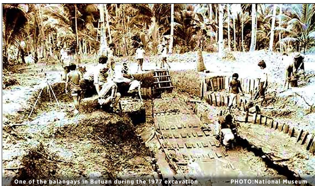
One of the balangays in Butuan during the 1977 excavation

The balangay might not have been the only watercraft used by our ancestors in crossing the seas, but it has proven itself to be an effective representation of how proud we are with our maritime tradition, a tangible symbol of our maritime consciousness. Our early population built these vessels using our people's ingenuity, making the most out of our own skills and resources. They had used it as a dwelling place for their kin as well as a means to travel from one island