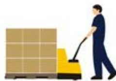
Electric Pallet Jack