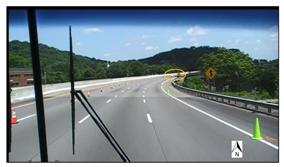
Photo 2. Recreation of motorist visibility; 900 feet south of crash site.

The investigator used mathematical computations to determine if the motorist should have been able to see the patrol unit and help truck, perceive the situation, and stop within 900 feet.