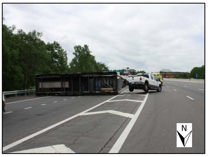
Photo 1. Initial incident the officers responded to, looking southbound in the northbound lanes.

Two TDOT help trucks also responded to this crash to assist with traffic flow and lane closure. Initially, both patrol units and both help trucks