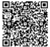
QR Code for Donations