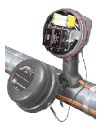
Bulb and Capillary Mechanical Thermostat

Common Plant Use: Accurate Temperature Maintenance and Critical Process Lines.