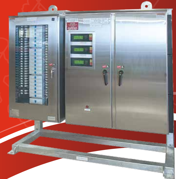
Controller Skid with Seal Breaker for IEC Hazardous Locations

Pre-assembled Controller Skids are an integral component of Thermon's total systems approach to provide you with the most cost effective heat tracing system.