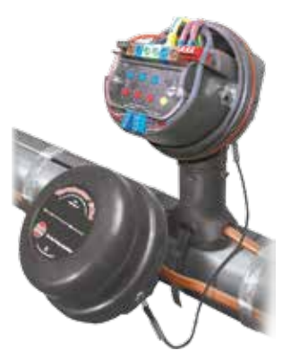
Electronic Thermostat with RTD Sensor