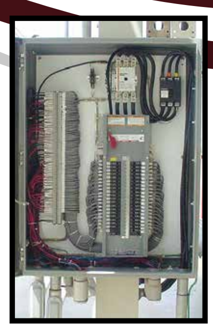
Basic Freeze Protection Panel