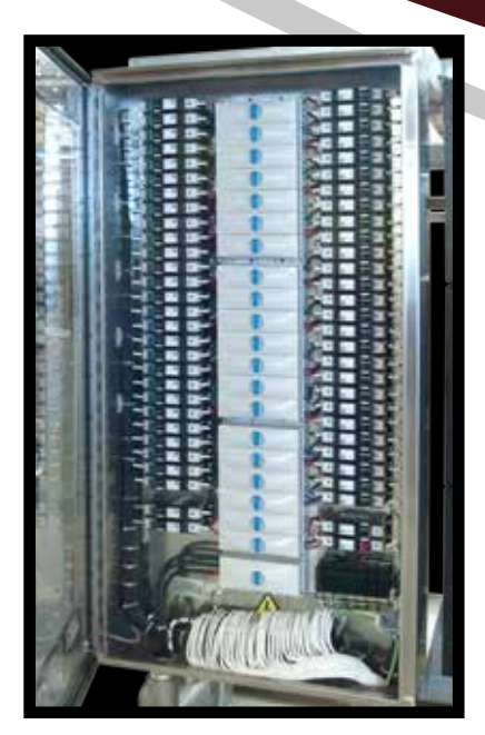
Power Distribution with Sealed Breakers

Controller Skid with Power Distribution and Transformer for NEC Hazardous Locations