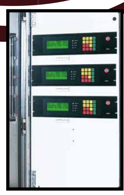
EHT Controller Panel without Power Distribution