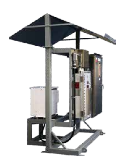
Typical Skid Frame with Weather Protection Canopy

Thermon recommends pre-approval of any non-standard skid layout and drawings and/or electrical specifications in the early stages of a project.