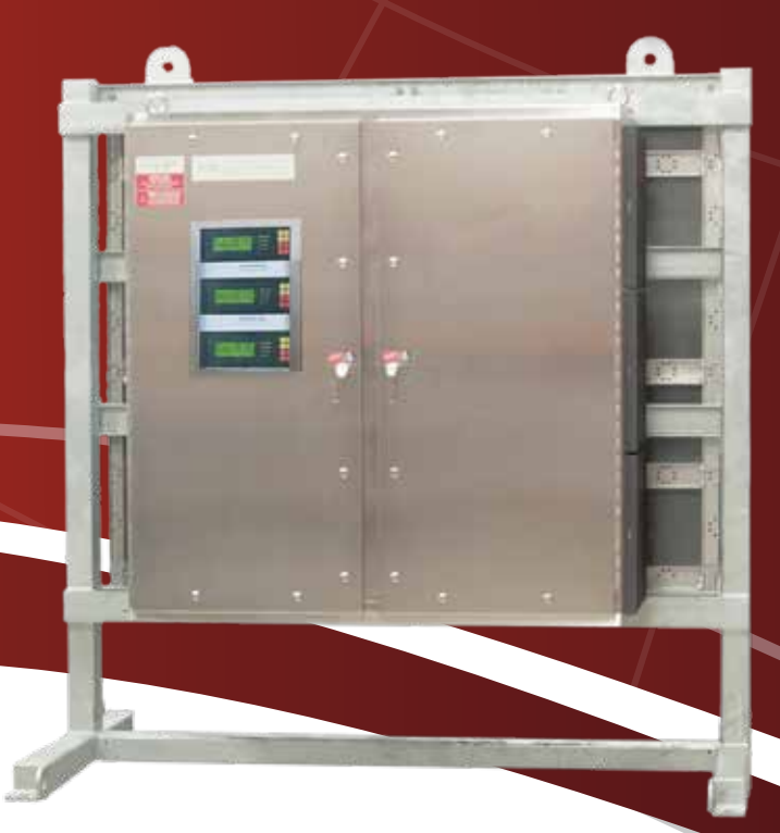
Controller Skid for IEC Locations

Knowing your particular application's requirements up front facilitates the rapid procurement of components and Controller Skid assembly, keeping the electric heat tracing project on track.