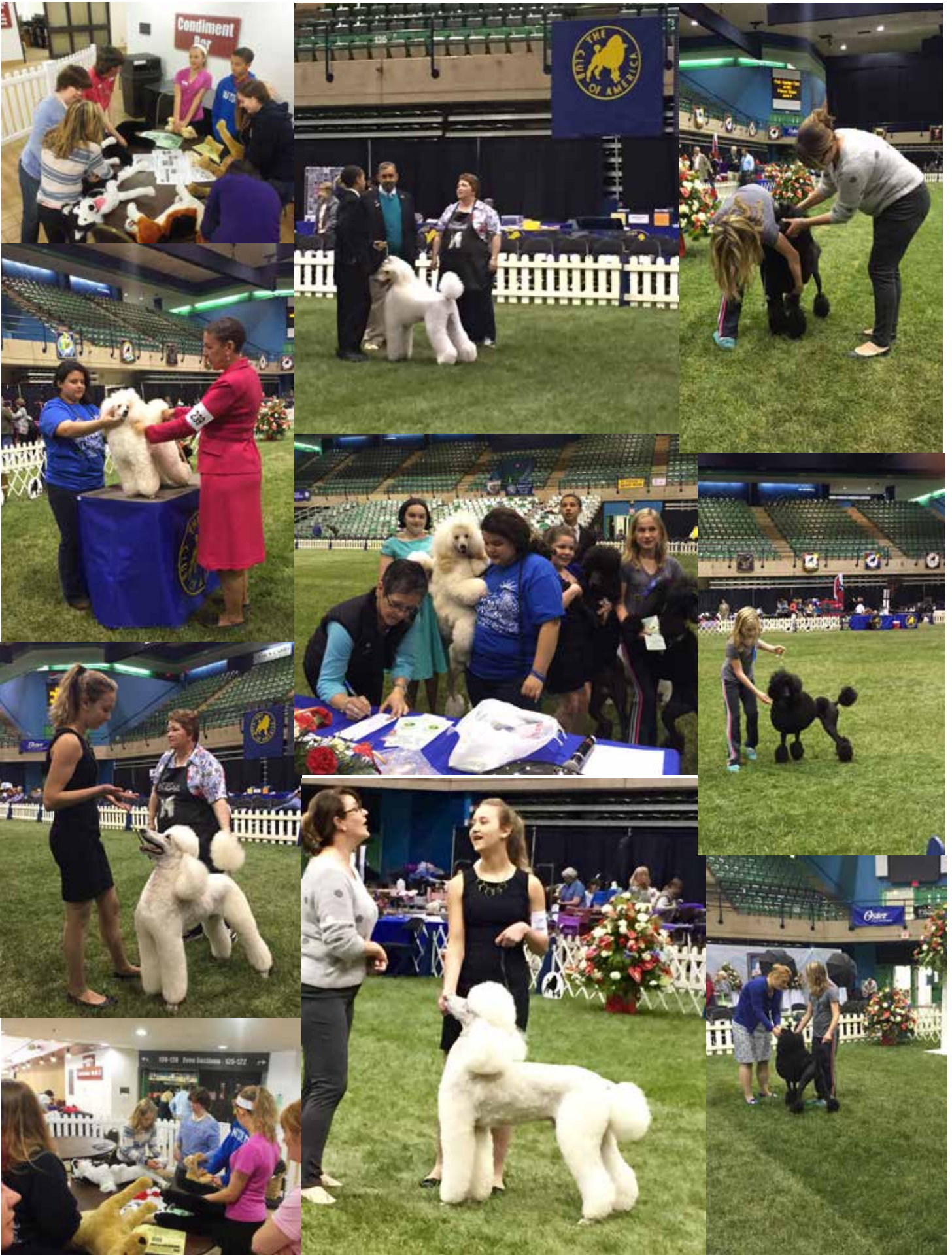
The Poodle Papers