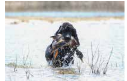
Raven Test Dog Water WCX