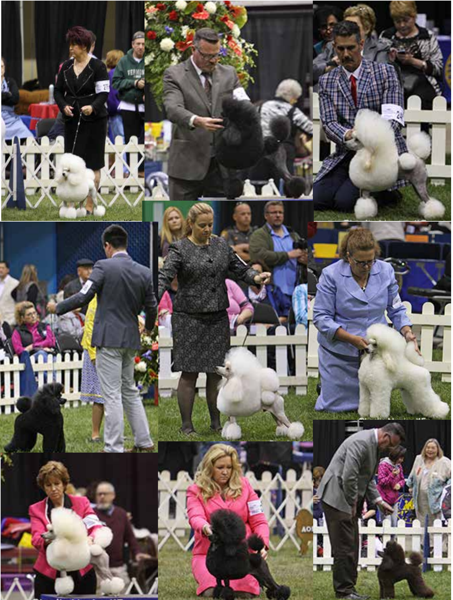
Minis at PCA 2015