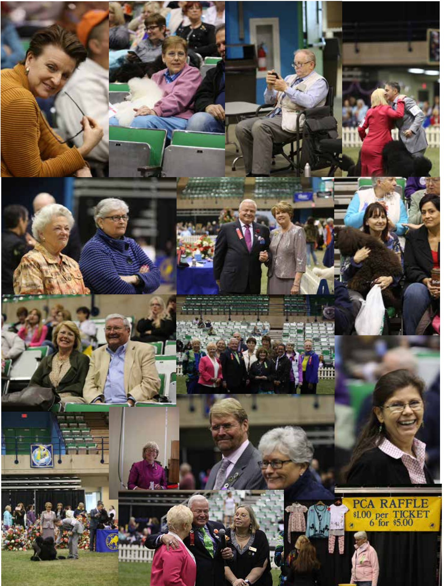
Faces of PCA