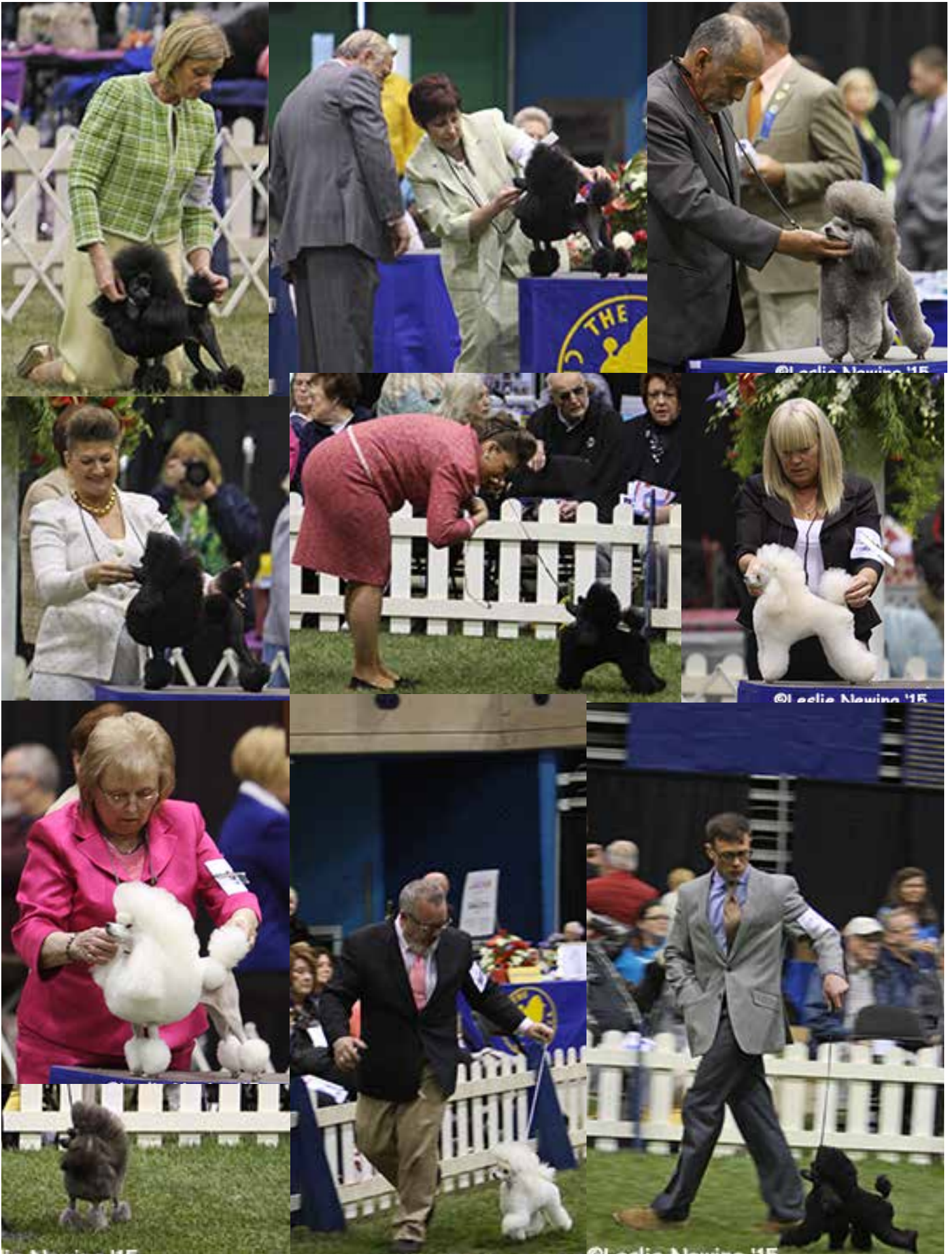
The Poodle Papers