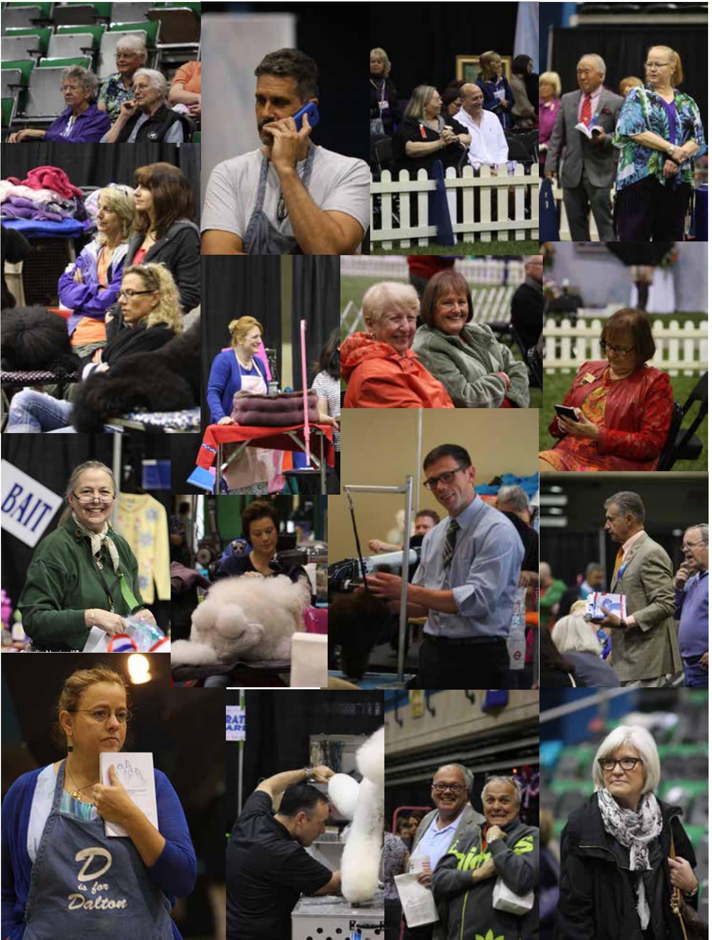
The Poodle Papers