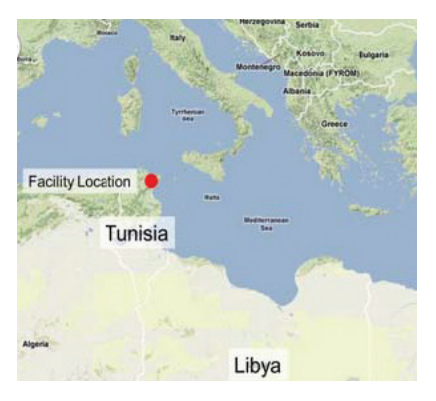
Hasdrubal Pipelines CUSTOMER BG Tunisia LOCATION Offshore Tunisia

CUSTOMER Petrobras LOCATION Guanabara Bay, Brazil