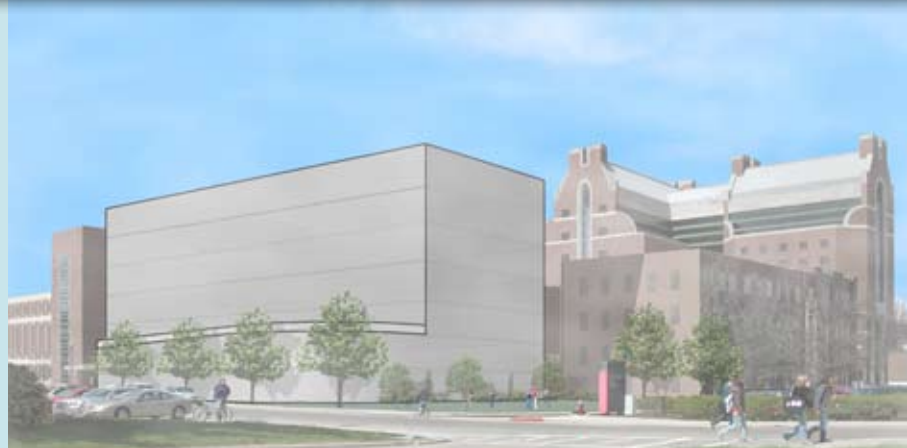
Artistic rendering from the feasibility study