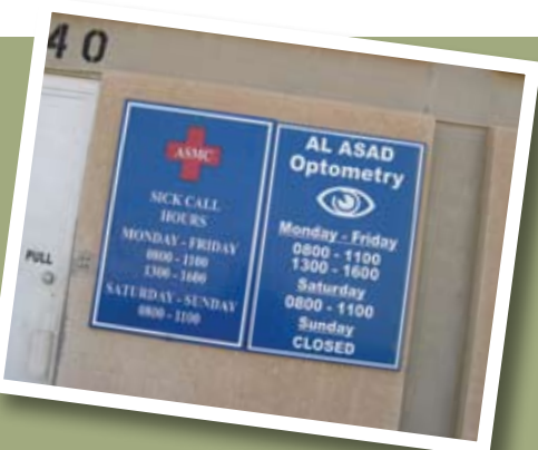
above: Sign showing the clinic hours on the base

It started out as a simple football cheer, something for late 20th Century fans to shout during football games. But these days, “O-H-I-O” means the whole package: strong athletic traditions, major school spirit, and the academic achievements and outreach efforts that make The Ohio State University the great place it is. In faraway lands all over the world, Buckeyes carry on the tradition. O-H-I-O. It’s a reminder of where “home” is.