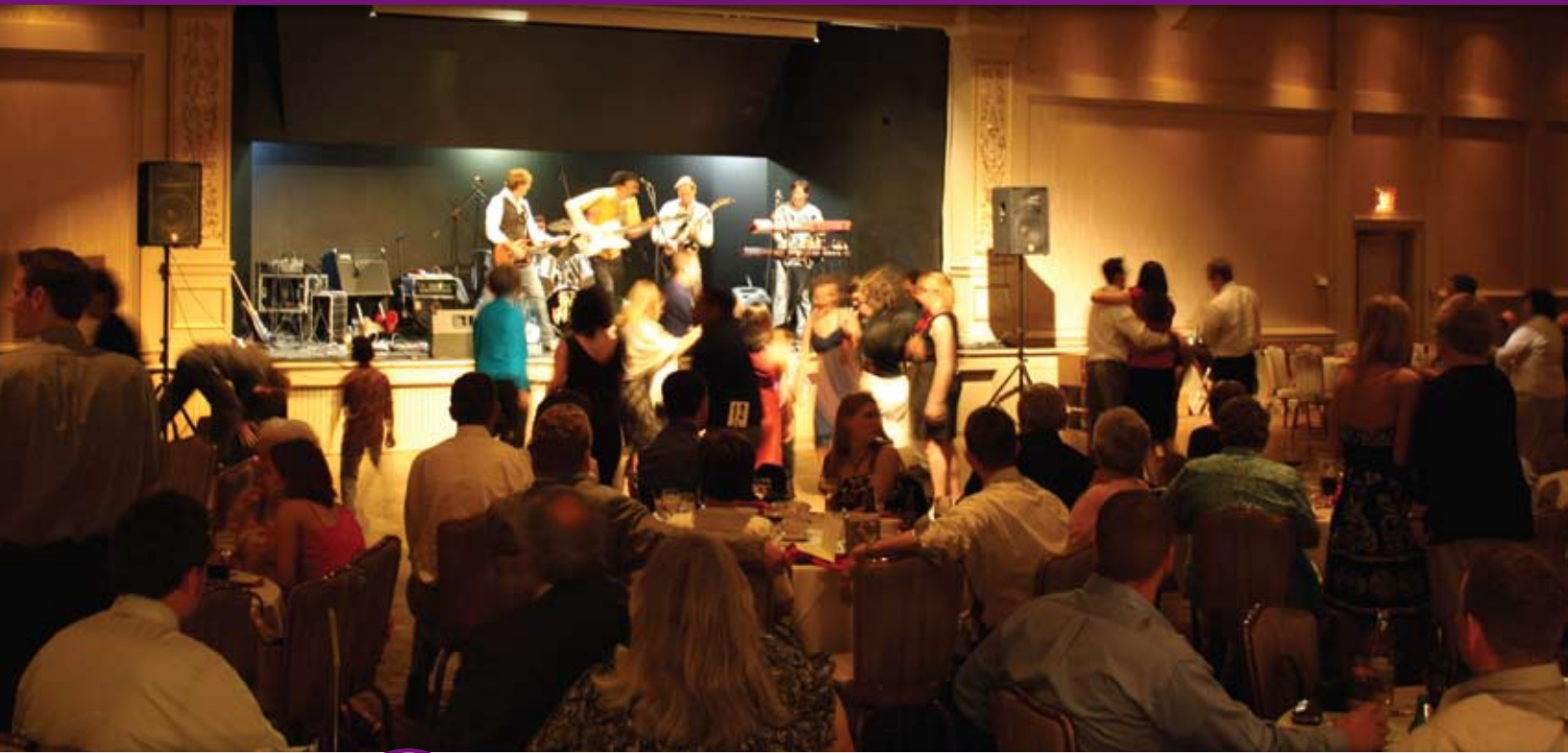
The Bad Habits (The Eye Docs of Rock) play at the graduation banquet.