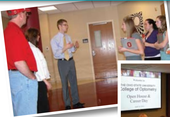
Photos from Open House