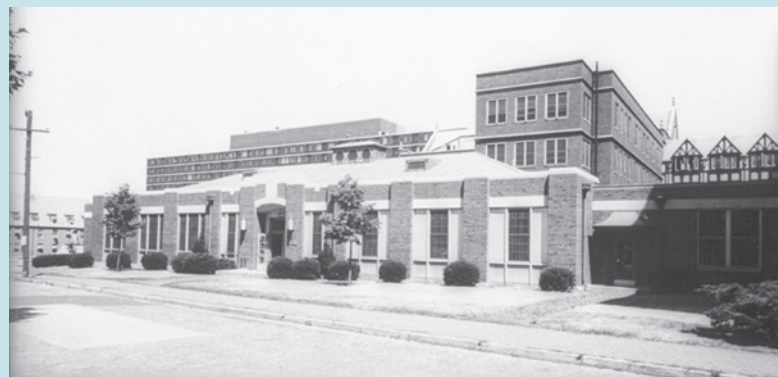
The "new" Fry Hall in the early 1950's.

For the College to continue to move forward in fulfilling its vision, new physical facilities are critical in order to meet current and future optometric scope of practice nationally, to recruit and retain